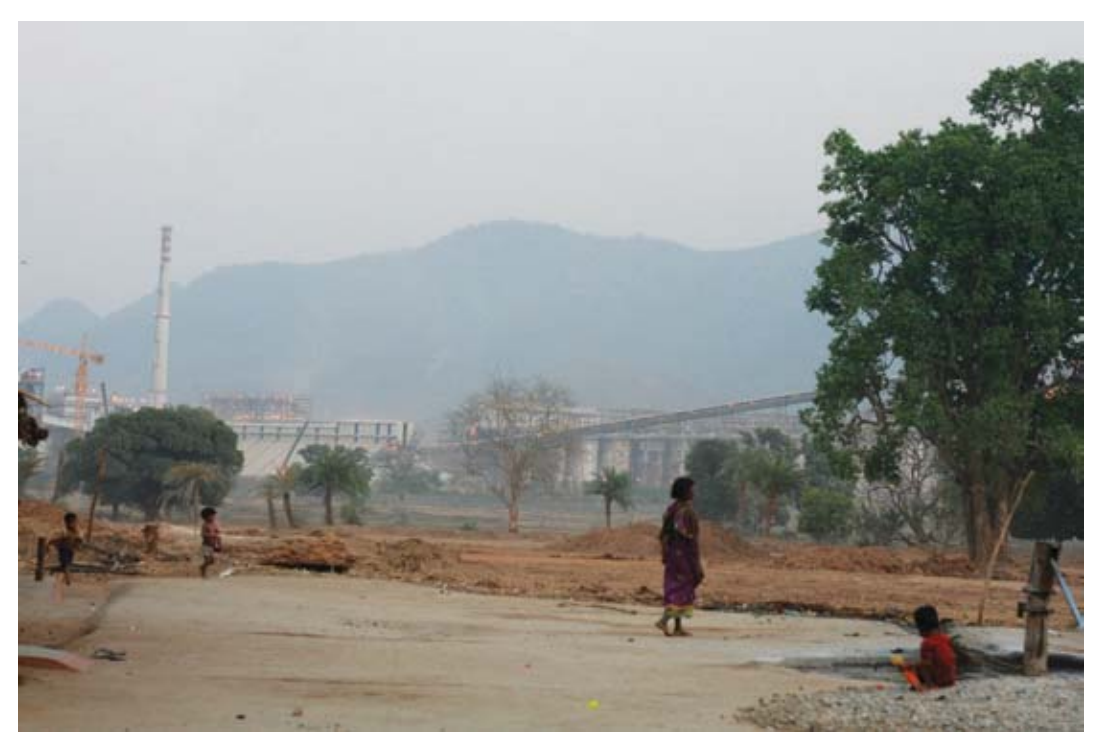
The Lanjigarh refinery, as viewed from Kenduguda village

In September 2010, Vedanta's bank lenders commissioned Scott Wilson Ltd (now URS Scott Wilson) as an independent environment and social consultant with terms of reference to review Vedanta's commitment to sustainable development and assess the social and environmental issues, particularly relating to the refinery and its expansion plans. The lenders required Vedanta to report, every six months, on progress of implementation of these recommendations until the Scott Wilson review determined that this was materially complete and all issues highlighted by it were substantially mitigated. The review's latest findings were published in March 2012 and include a series of recommendations.<sup>105</sup>