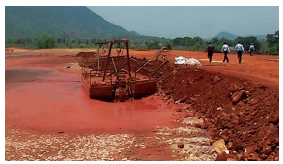
East red mud pond at Lanjigarh, 2011 @ Al