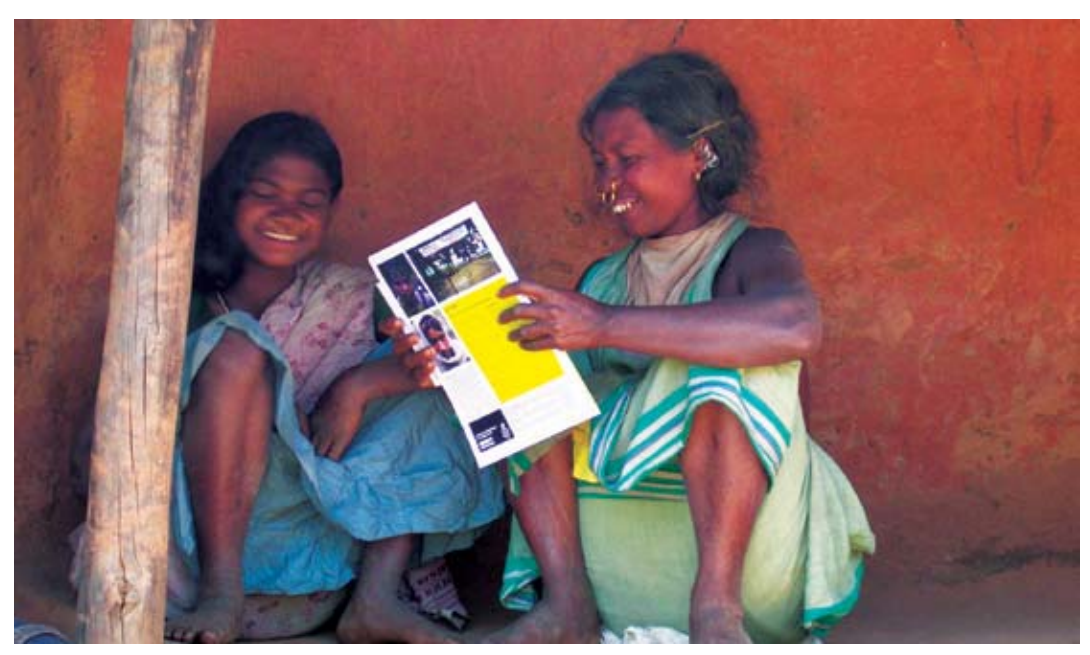
Dongria Kondh women with Amnesty International material

Orissa government nor the companies concerned made any attempt to provide information to them on the details of these plans, let alone consult them or seek their consent. A number of communities living at the top of the Niyamgiri hills informed Amnesty International that most plans continued to be decided not in consultation with or with the consent of the Dongria Kondh communities. They also stated that they continued to have no representation in meetings of elected village council bodies, which the authorities were required to consult with under the terms of the PESA. Also, these meetings were generally on the plains and not in the hills where Dongria Kondh mainly reside.