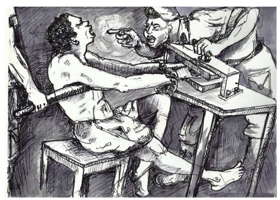
Figure 10- An artist's drawing depicting an interrogation. © Chijioke Ugwu Clement

in connection with serious crimes such as armed robbery or murder are particularly at risk of being tortured to extract confessions, as the police are under pressure to solve such cases.