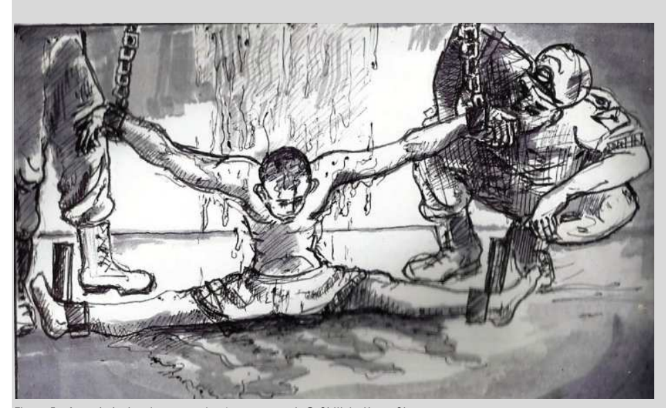
Figure 5 - An artist's drawing portraying 'water torture'. \ \odot Chijioke Ugwu Clement

Some former detainees have also described other forms of abuse that may violate the absolute prohibition of torture and other ill-treatment, including experiencing mock executions and being forced to watch other people being extrajudicially executed. As a result of increased scrutiny by human rights non-governmental groups, Nigerian human rights organizations have reported new methods of torture aimed at hiding visible marks on the body of victims. This include covering the ropes used in tying up suspects with cloth to avoid any mark on the body; and tying the upper arm of suspects with rubber to choke the flow of blood and covering detainees with plastic and placing them in the sun until they die.