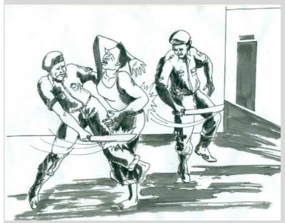
Figure 1 – An artist's drawing portraying a beating with machetes. © Chijioke Ugwu Clement

• Beatings: The vast majority of former detainees have stated that they were beaten or whipped by objects including gun butts, machetes, batons, sticks, rods and cables. Beatings can last for hours. Before being beaten, detainees are often stripped, either naked or above the waist, and their hands are restricted and heads covered: a form of torture known as 'ashasha.'