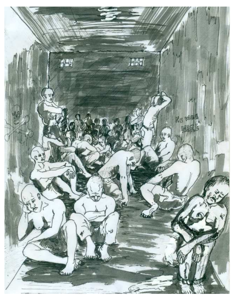
Figure 11 - An artist's drawing depicting Mustafa's account. © Chijioke Ugwu Clement

Conditions in detention facilities in Damaturu are also poor, and appear to amount to ill-treatment. Most of the detainees are kept at 'Sector Alpha' which consists of shops that were deserted and are now being used to detain people – there are no toilets or proper ventilation. Consistent accounts recorded by Amnesty International suggest that up to 50-70 people are put in cells that can only fit about five people. Conditions are marginally better at the Presidential Lodge ("guardroom") also in Damaturu where detainees are kept in rooms that have been created by dividing a former squash court. About 15-20 people are kept in a room of 15 by 20 feet, but detainees are allowed to move around in the corridors during the day. There are also some toilets for common use at the end of the corridor.