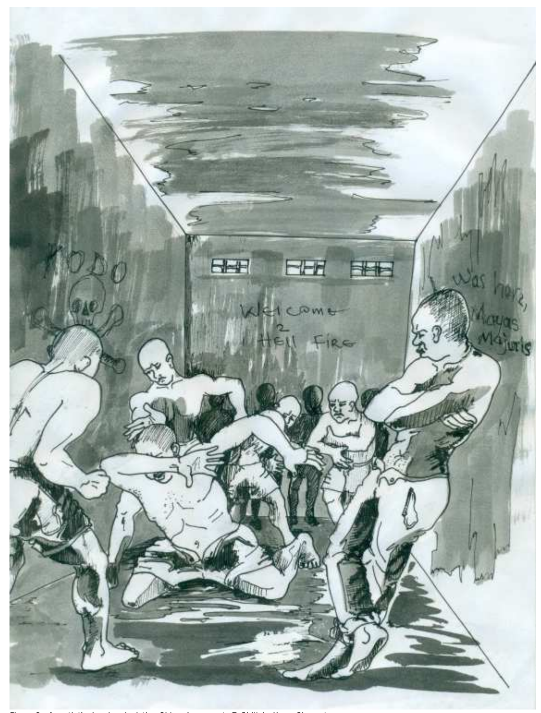
Figure 9 - An artist's drawing depicting Chinwe's account. \ \odot Chijioke Ugwu Clement