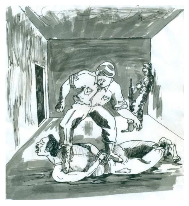
Figure 6 - An artist's drawing depicting Ahmed's account. © Chijioke Ugwu Clement

Many of my colleagues did not make it [died in detention]. The beating, the torture was just too much for us. They do all types of things to you, the soldiers. They will tie your hands behind your back, with the elbows touching and then one of them will walk on your tied hands with their boots. Your hands will remain tied and then they'll pour salt water on your wounds. You can't rub it, even if it goes into your eyes. My eyes got swollen as a result of that. I thought I was going to be blind. I have never experienced such brutality in my life."<sup>23</sup>