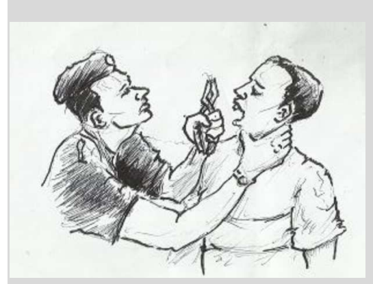
Figure 2 - An artist's drawing portraying a tooth being extracted by a police officer. © Chijioke Ugwu Clement