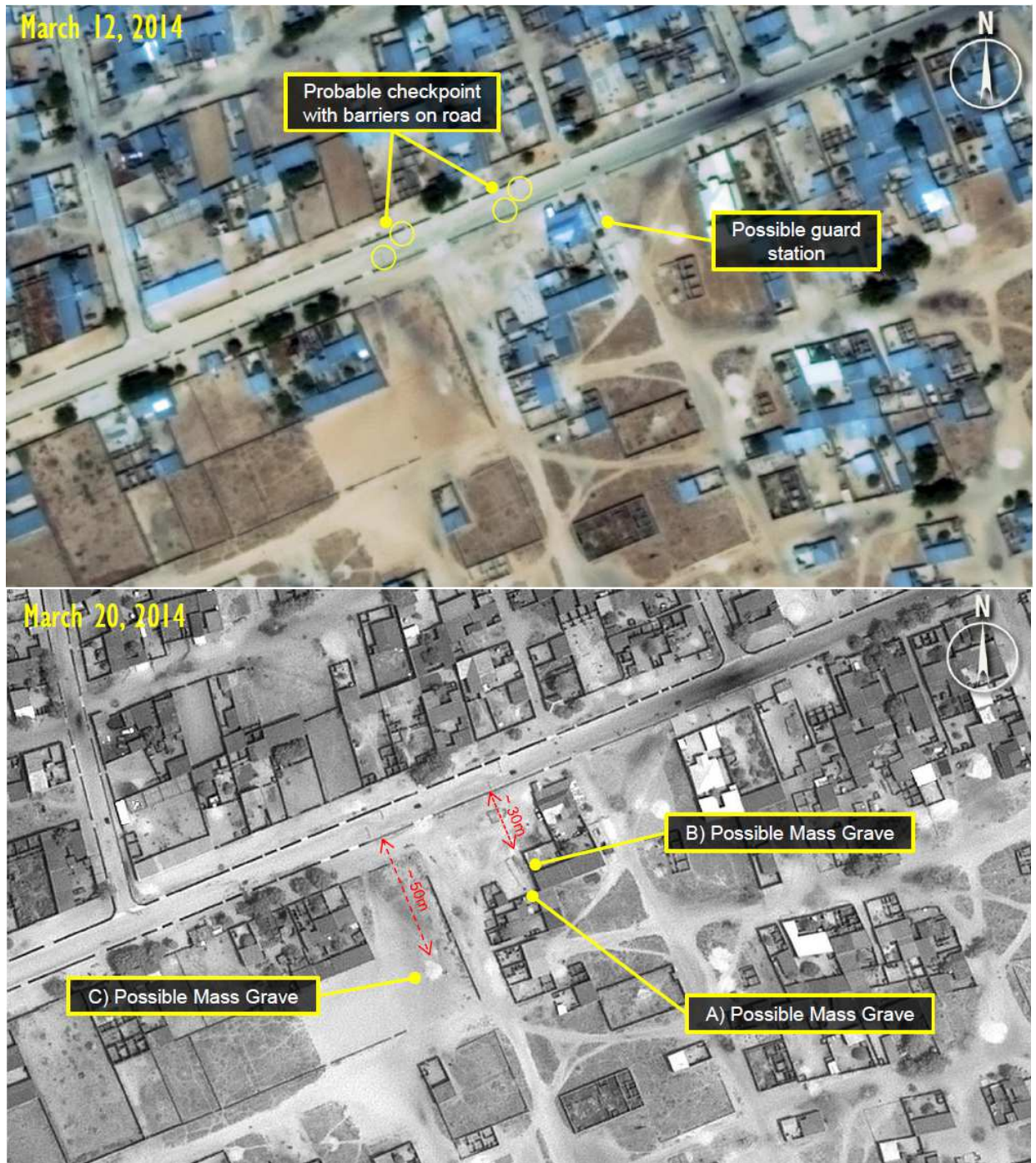
Top: Satellite images from 12 and 20 March 2014. A probable checkpoint is observed behind the UMTH. New areas of disturbed earth can be seen between March 12 and March 20, 2014. Measurements of the possible grave sites are: A) 12x2 meters, B) 8x2 meters, C) Diameter is 6 meters.