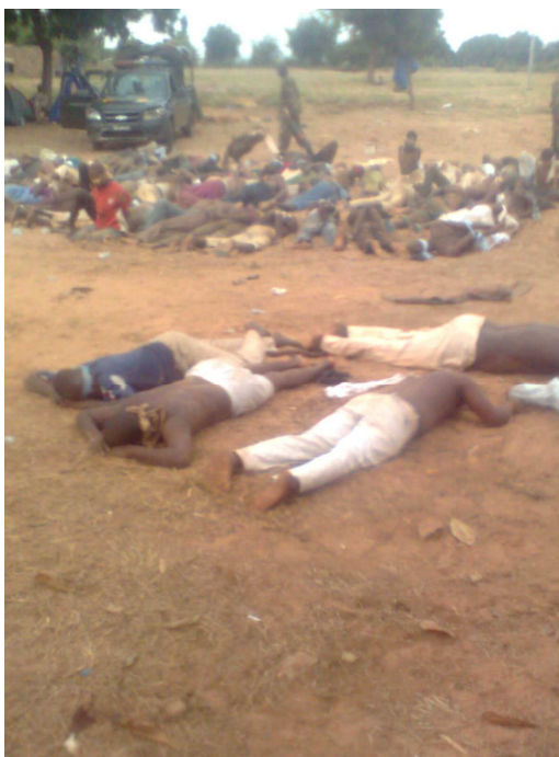
Potiskum, October 2013, people killed by the security forces in a military operation in Yobe state.

In a situation of non-international armed conflict, Nigeria remains bound by its obligations under international human rights law. And all parties to the conflict, including non-state armed groups such as Boko Haram, are bound by the rules of international humanitarian law (IHL).