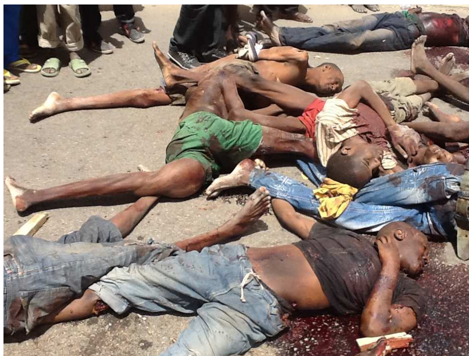
Former detainees shortly after they were re-arrested by the “civilian JTF” and executed by the security forces in Jiddari Polo area in Maiduguri on 14 March 2014.