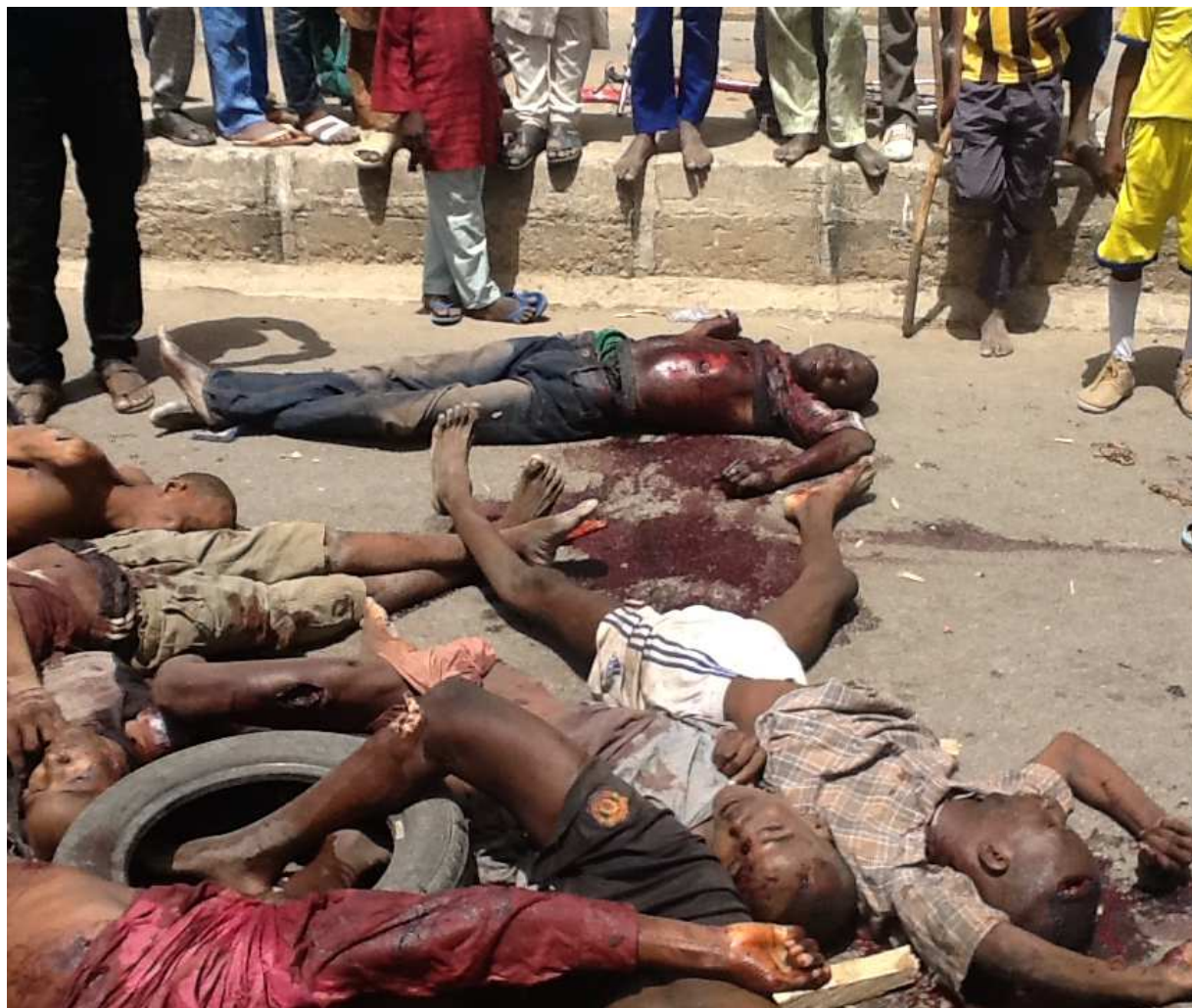
Former detainees shortly after they were re-arrested by the “civilian JTF” and executed by the security forces in Jiddari Polo area in Maiduguri on 14 March 2014.