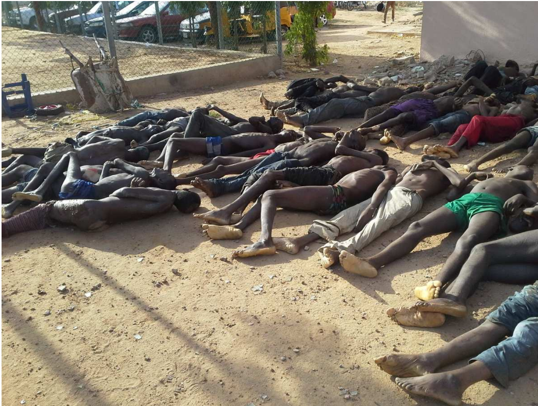
Bodies of detainees from 'Guantanamo' (sector Alpha detention centre) in Damaturu, Yobe state, June 2013. None of the bodies had gunshot wounds and according to a senior military officer these bodies were among 47 detainees who died of suffocation in one day.