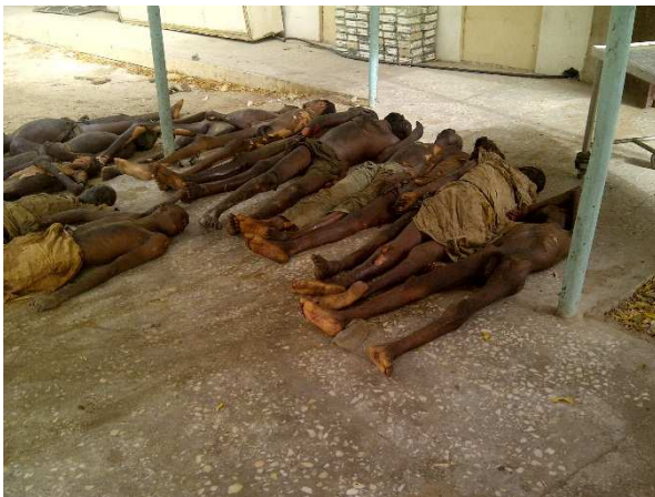
Corpses of detainees from Giwa Barracks, brought by the military to the mortuary in Maiduguri, April 2013.