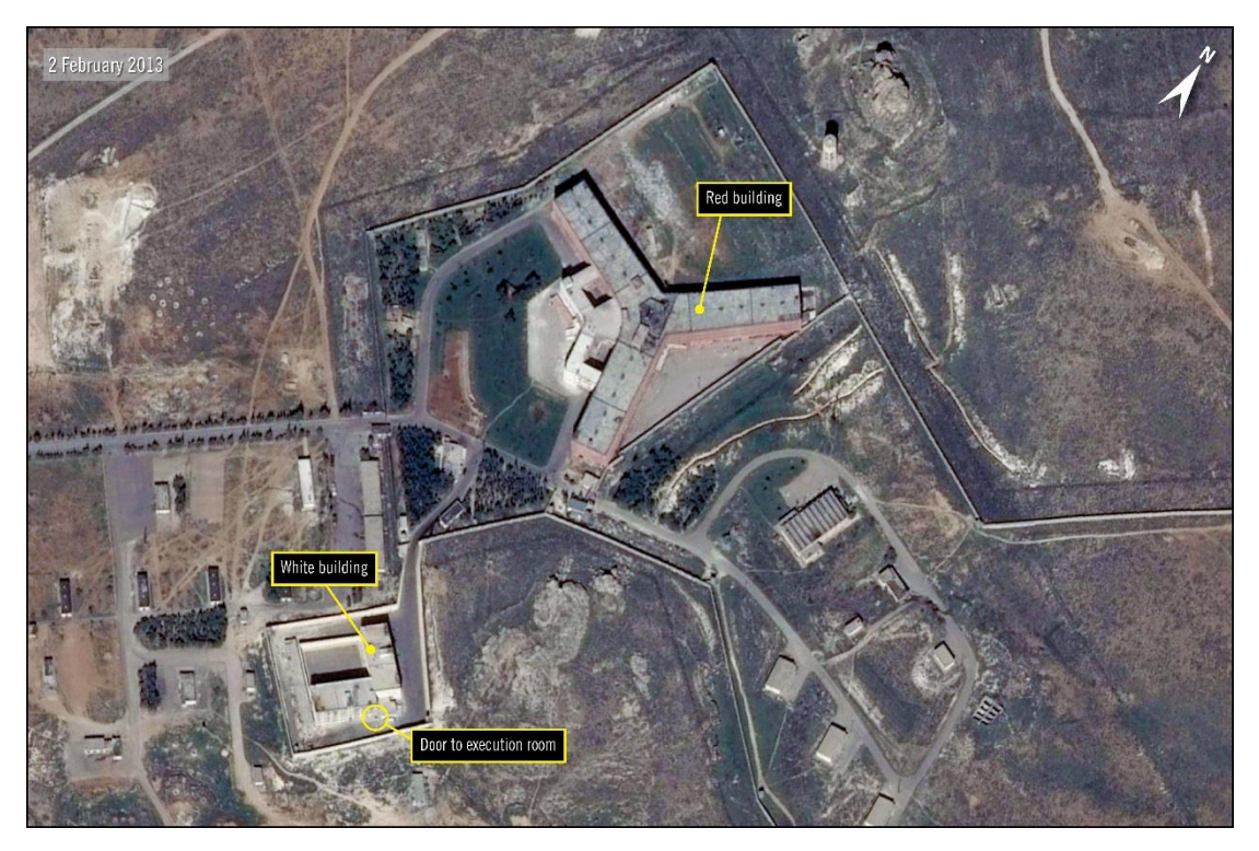
Satellite image of Saydnaya Military Prison. Coordinates 33.6648°, 36.3288°

The following information is based on information from individuals who have witnessed hangings at Saydnaya since 2011. According to these witnesses, the vehicles depart the red building and enter the perimeter of the white building, usually between 12am and 3am. The vehicles drive around the corner of the white building and stop in front of the "execution room" which is located in the south-east corner of the building. The "execution room" is located in the basement level, under the room on the ground floor where the family visits are conducted for detainees held in the white building. The room is accessed from an external door made of steel, which is below the ground level and preceded by a stairway. The white building is situated on a slope, and at the highest point, the street level is 1m below the ceiling of the room.