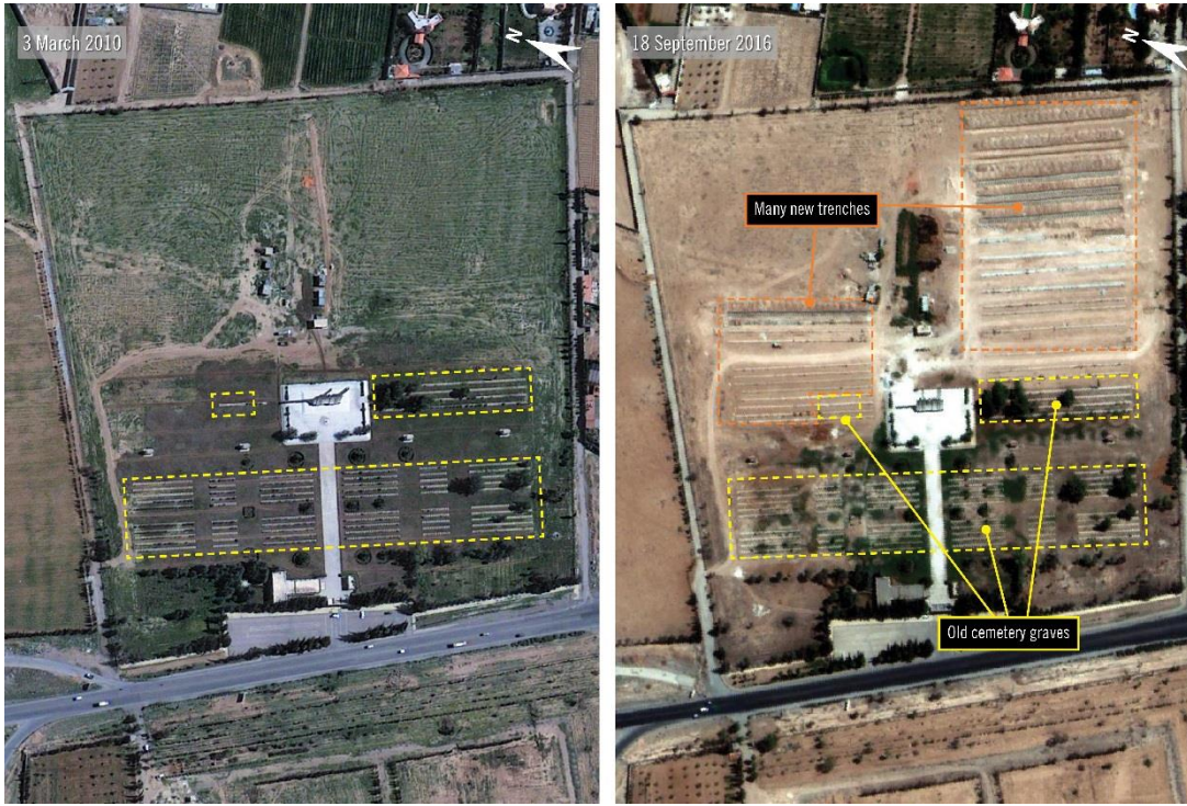
The Martyrs Cemetery is located south of Damascus, along the road to Najha. In 2010, imagery shows cemetery with graves in a strategic layout with carefully designed columns and rows. In 2013, new 90 metre long trenches begin to appear over the course of the year continuing into 2014. By 18 September 2016, imagery shows the grave area has more than doubled in size with additional 90 metre long trenches. Coordinates 33.4114°, 36.3697°. Left image: Google Earth © 2016 DigitalGlobe, right image: © 2016 DigitalGlobe, Inc.