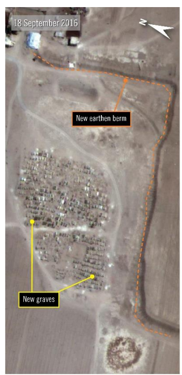
Najha cemetery: Only 300 metres east of buildings in Najha, a small cemetery is visible from imagery from 6 August 2009. The cemetery does not expand significantly until 2014. On 3 June 2014, one vehicle can be seen next to newly dug graves in the image. On 18 September 2016, approximately 125 new graves are visible since 2010. A new earthen berm is also visible, possibly constructed to better secure the town.

Coordinates 33.3844°, 36.3824°.