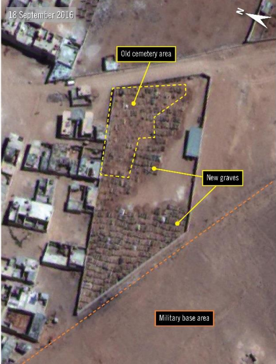
On 3 March 2010, imagery shows a small cemetery approximately 500 metres north of Najha, adjacent to a military base. In 2011, walls were erected around the cemetery though the number of graves only began to increase significantly, according to available imagery, after August 2013. On 18 September 2016, imagery shows the graves in the cemetery have more than doubled.

Coordinates 33.3927°, 36.3685°.