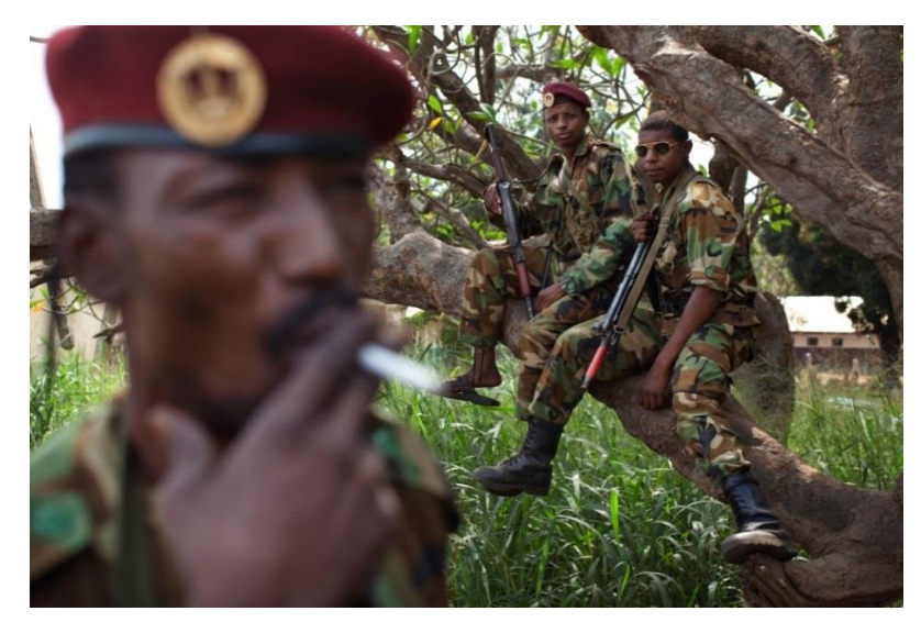
Séléka fighters wait as their commander meets with Multinational Force of Central Africa (FOMAC) peacekeepers at the FOMAC camp in Bossangoa. © Reuters, 25 November 2013.

Currently, the north-eastern part of the country is under the rule of the Séléka and armed Peulhs cattle herders. Both groups are still committing serious human rights abuses on territories under their control. In addition, around 700 combatants led by the Chadian rebel Baba Laddé have joined the Séléka.<sup>106</sup>