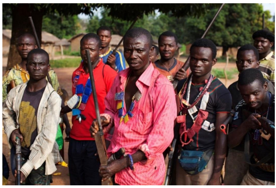
Anti-balaka militia fighters in Mbakate village, Central African Republic. © Reuters, 25 November 2013.

Neither the election of the Transitional President Catherine Samba-Panza, nor the presence of MISCA and French forces, stopped the Anti-balaka from attacking the Muslim population in Bangui and in western CAR. The slow response of the Transitional authorities and international peacekeeping forces to tackle the atrocities of the Anti-balaka, allowed the armed group to assert their authority in many parts of the country, including in Bangui, and increase their capacity to commit further violence.