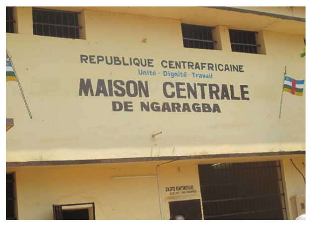
Ngaragba Prison in Bangui, Central African Republic.

These incidents happened despite the presence of the AU-led MISCA forces<sup>32</sup> guarding the prison, which is located close to the official residence of the country's Transitional President. The detention on 16 February 2014 of 11 suspected Anti-balaka commanders at the same prison was seen by many as a sign of hope that the judicial system was starting to work in the country. But on 6 March, 10 of these detainees forced their way out of the prison. MISCA troops and members of the CAR gendarmerie guarding the prison didn't take any action to stop them. According to several eye witnesses including prison personnel, these individuals were not armed and passed in front of the MISCA and the gendarmes before boarding public transport buses and taxis in front of the prison's gates.