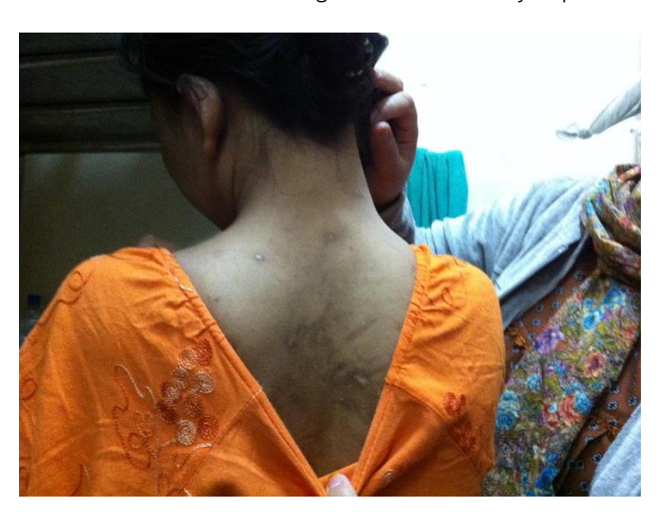
An Indonesian former domestic worker shows researchers the marks on her body that she said were inflicted by her employer.