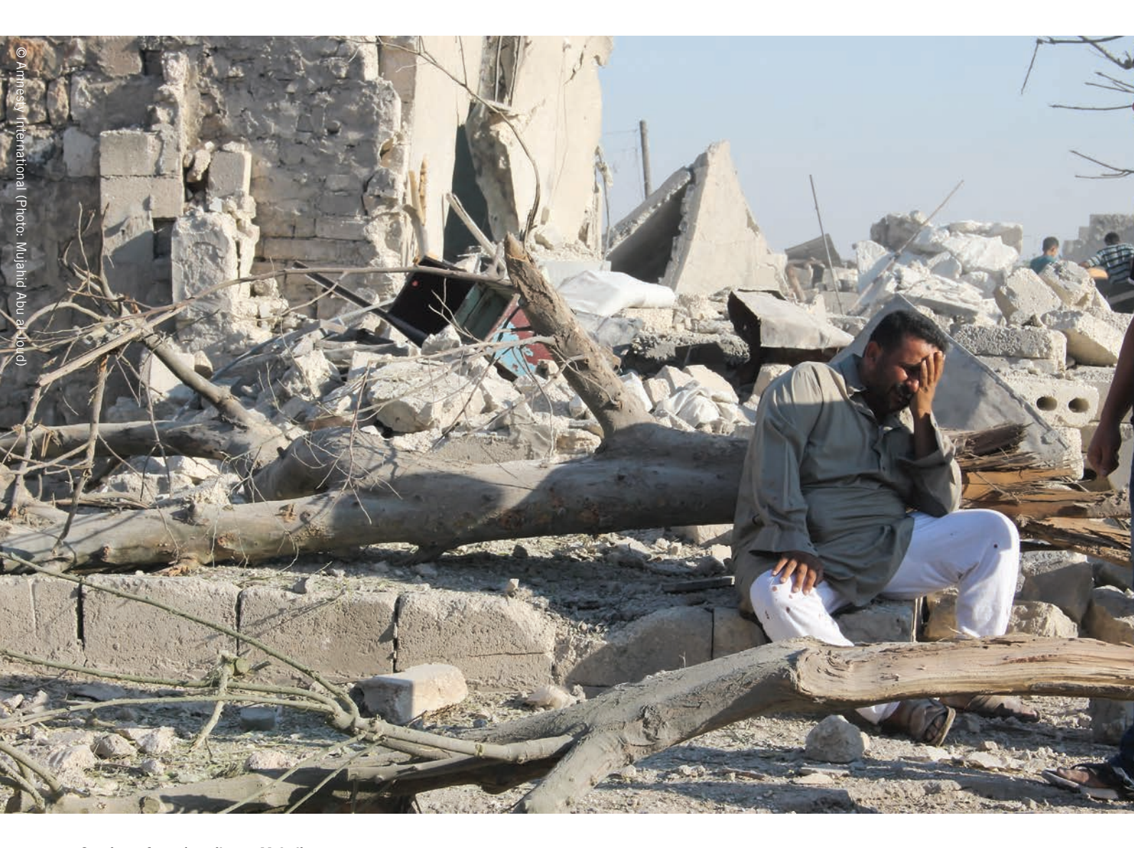
Survivor of an air strike on Ma'adi neighbourhood, 11 July 2014.