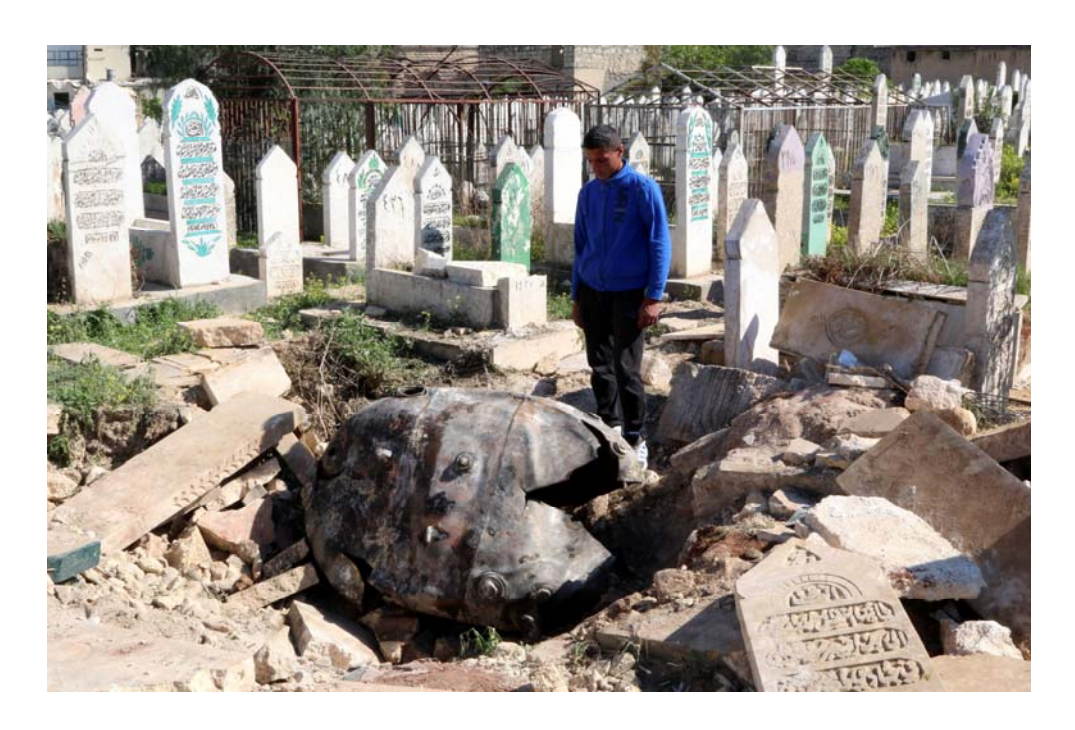
A man looks down at an unexploded barrel bomb dropped by forces loyal to Syria's President Bashar al-Assad at a cemetery in the al-Qatanah neighbourhood of Aleppo. 27 March 2014

According to the Syrian Network for Human Rights, 12,194 people were killed in Syria from 2012 until February 2015 as a result of barrel bomb attacks by government forces. Only 473 of these people were fighters, meaning that 96% of this total were civilians. More than half were killed after the adoption of UN Security Council Resolution 2139. As of February 2015, of all governorates in Syria, Aleppo suffered the greatest number of victims from barrel bomb attacks. According to the Violations Documentation Center, 3,124 civilians – and only 35 fighters – were killed in barrel bomb attacks from January 2014 to March 2015 in Aleppo governorate. Local monitors told Amnesty International that the large number of civilian casualties is likely due to the fact that barrel bombs are so imprecise that the government rarely drops them near the front line, where they might hit their own forces. Instead, barrel bombs have struck apartment buildings and populated areas such as public markets, transportation hubs and mosques.