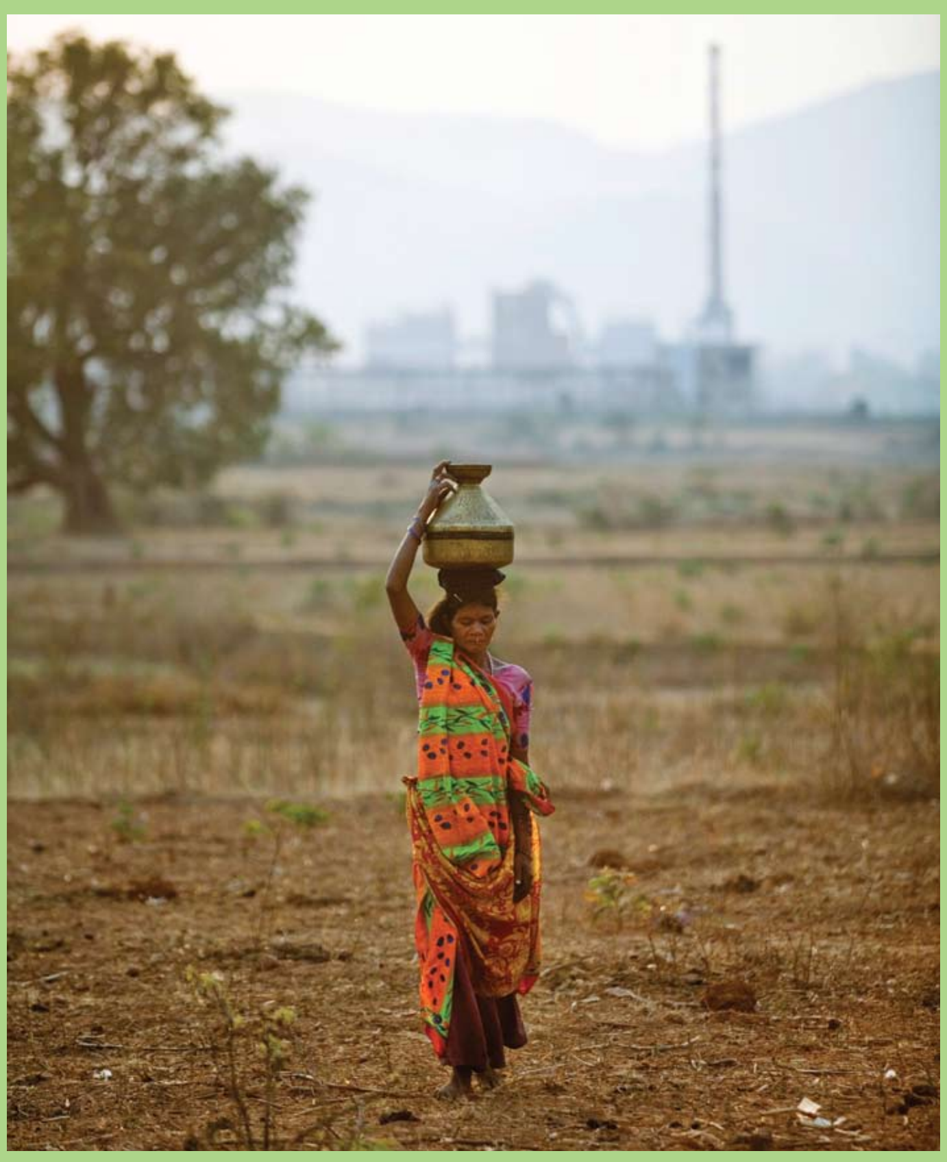
An Adivasi woman carrying a pot of water on her head in front of the Vedanta refinery in Lanjigarh.

Cover photo: A villager stands on land he once owned, beneath an unfinished conveyor belt designed to carry bauxite ore from the Niyamgiri hills to the Vedanta Alumina plant in Lanjigarh.