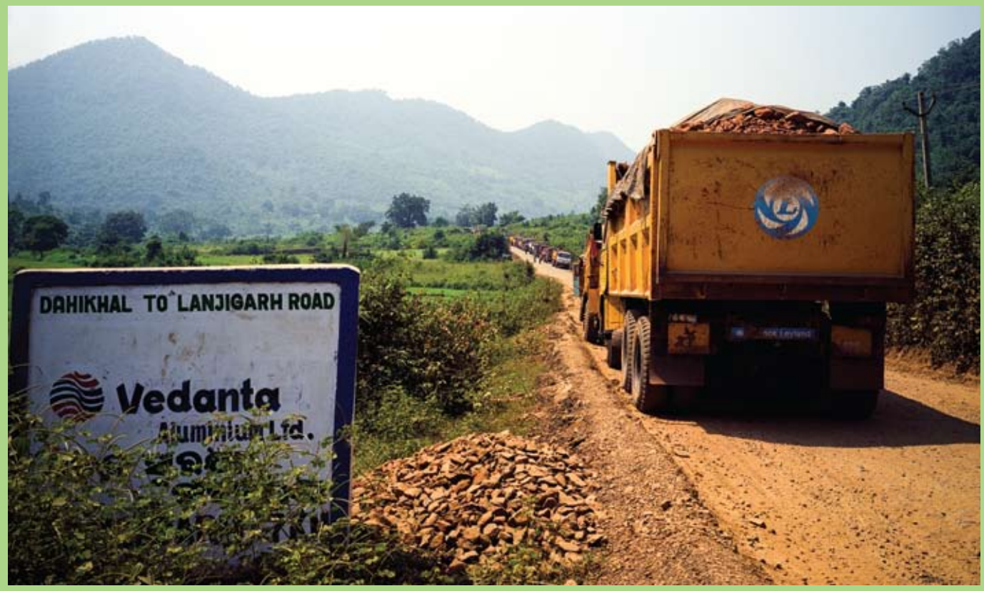
Vedanta's refinery has brought heavy traffic to the area