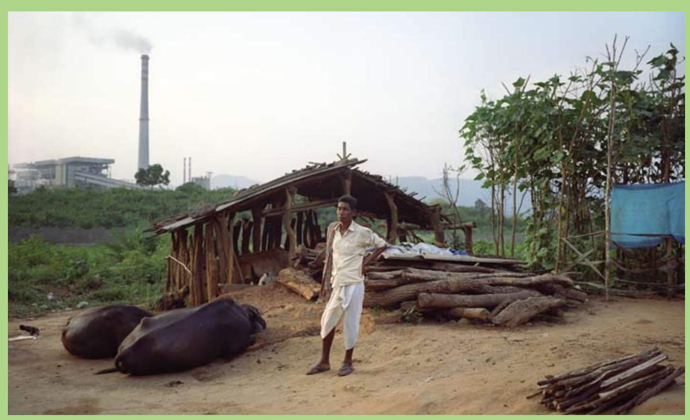
Lanjigarh village in the shadow of the Vedanta alumina refinery

At the public consultation for the environmental clearance for the project, local communities were not provided with any information on pollution or on the waste management structures that would be set up next to their villages. Nor were they informed of the associated risks for the environment.