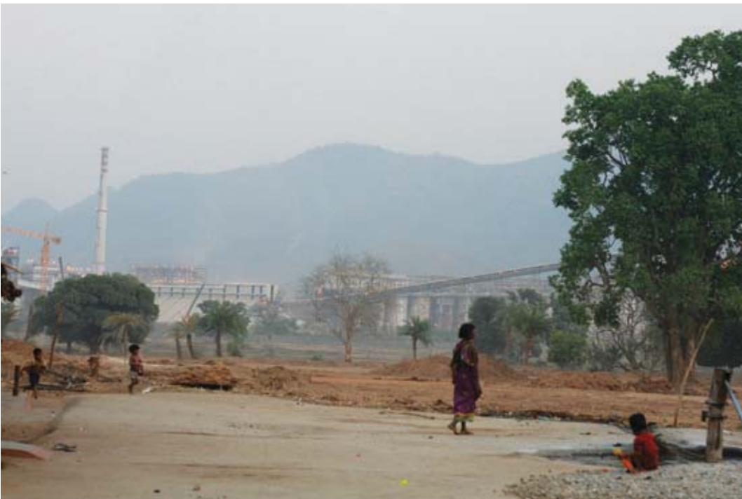
The Lanjigarh refinery, as viewed from Kenduguda village

In September 2010, Vedanta's bank lenders commissioned Scott Wilson Ltd (now URS Scott Wilson) as an independent environment and social consultant with terms of reference to review Vedanta's commitment to sustainable development and assess the social and environmental issues, particularly relating to the refinery and its expansion plans. The lenders required Vedanta to report, every six months, on progress of implementation of these recommendations until the Scott Wilson review determined that this was materially complete and all issues highlighted by it were substantially mitigated. The review's latest findings were published in March 2012 and include a series of recommendations. 105