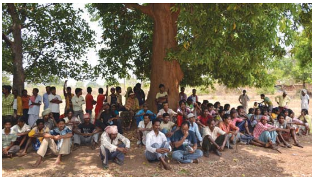
Dongria Kondh protestors at a campaign meeting at Jagannathpur on 9 April 2012