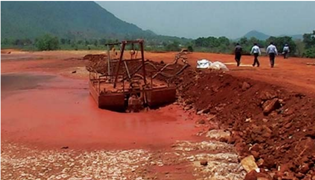
East red mud pond at Lanjigarh, 2011