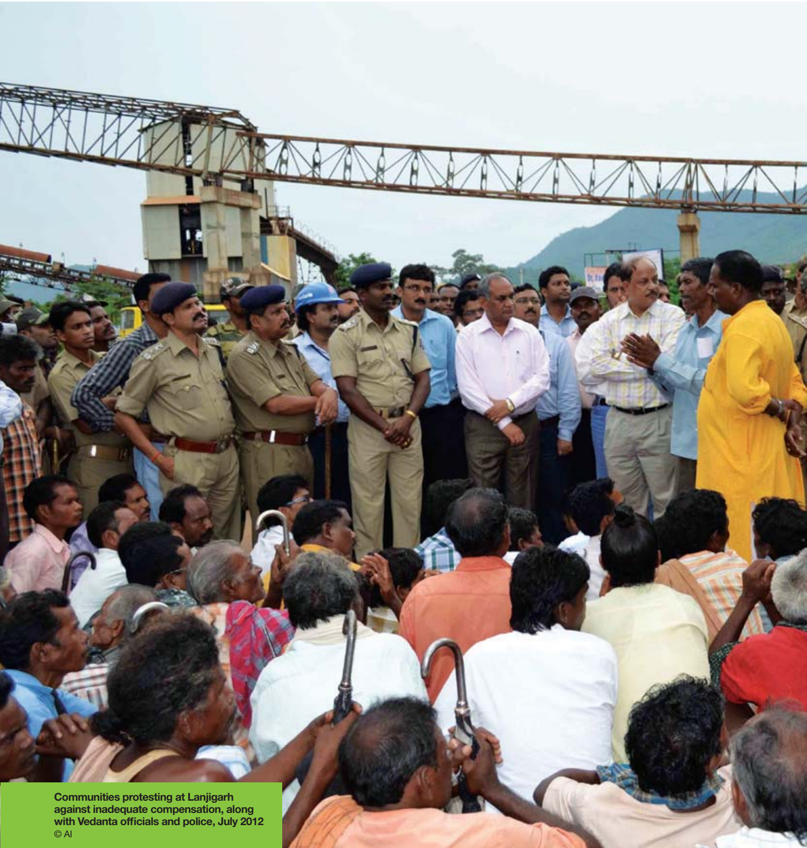
Communities protesting at Lanjigarh against inadequate compensation, along with Vedanta officials and police, July 2012