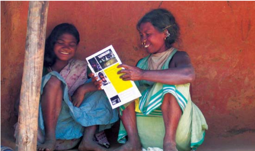
Dongria Kondh women with Amnesty International material

Orissa government nor the companies concerned made any attempt to provide information to them on the details of these plans, let alone consult them or seek their consent. A number of communities living at the top of the Niyamgiri hills informed Amnesty International that most plans continued to be decided not in consultation with or with the consent of the Dongria Kondh communities. They also stated that they continued to have no representation in meetings of elected village council bodies, which the authorities were required to consult with under the terms of the PESA. Also, these meetings were generally on the plains and not in the hills where Dongria Kondh mainly reside.