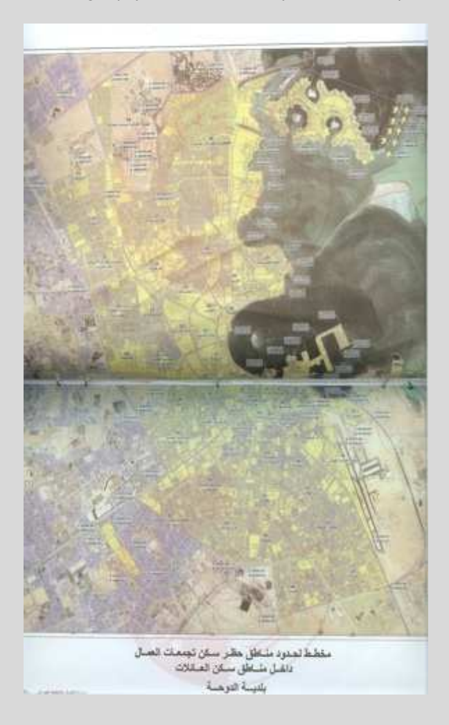
Scanned copy of a map of Doha attached to the 2011 decree. The areas in yellow mark out the areas where workers' housing is banned.

Other statements have suggested that the ban only applies to construction workers or that companies with small groups of labourers working on projects in urban areas may be allowed to keep their workers there. 168