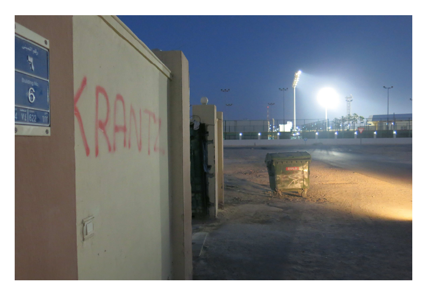
Floodlights blaze at the nearby Al Khor football stadium, while the lights are off at the Krantz accommodation

When Amnesty International researchers visited the camp on 13 March, there was no air conditioning or lighting and the men were using candles and torches. On 15 March Krantz moved the workers from Al Khor to another camp with power.