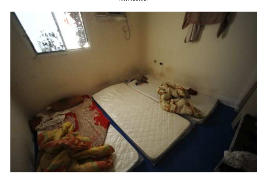
Bedroom, PCSI workers' accommodation, October 2012. These workers had moved mattresses into this room because it had air conditioning, unlike their allocated room

Workers expressed their frustration at the fact that they had raised these issues on numerous occasions with the company. One man said: