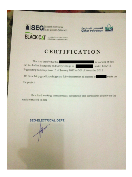
A Krantz worker's certification issued by SEG attesting to the quality of his work until November 2012 on the RLESC project, a Qatar Petroleum project

Among other things, QP should develop effective policies and processes to incorporate human rights criteria when it assesses the suitability of contractors bidding for tenders on its projects, and monitor the implementation of human rights standards included in contracts it signs.