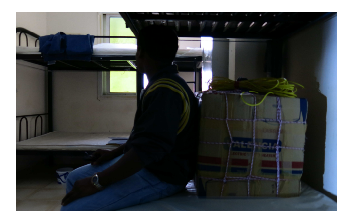
An Indian Krantz employee with his bags packed to leave in March 2013. He was not able to leave Qatar until 27 May, after falsely signing papers saying that he had received all his pay — he had not

"It is understood that your sponsor [the Qatari owner of the company] is blackmailing the Indian nationals by withholding their passports and making them beg for the same and the passports are returned only after getting signatures on blank letterheads and signing for the receipt of all pending dues. You are fully aware of this situation." <sup>158</sup>