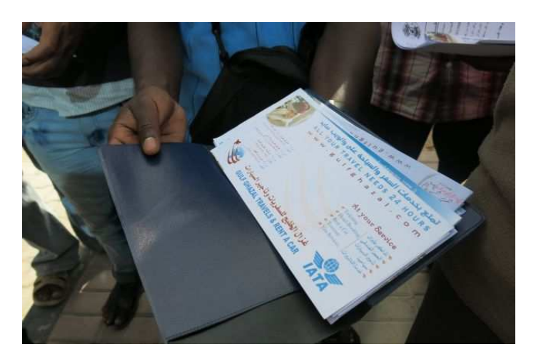
Tickets are handed to the men outside the Ministry of Justice as they prepare to sign to say, falsely, that they have received their salaries

A representative who was sent by ITC to deal with the matter at the Ministry of Justice gave the men their tickets in return for signing, and told the men that they would receive their passports at the airport.