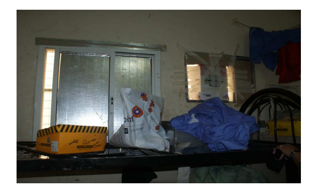
Hole in the wall where an air conditioner should be installed. Camp in Doha's Industrial Area, October 2012

In at least four of the camps that Amnesty International researchers visited, there were severe problems with air conditioning. In one camp several rooms, including a kitchen and several bedrooms, did not have air conditioning units installed at all. In three camps the units were not supplied with power. Lack of air conditioning renders rooms virtually uninhabitable all year round even in the cooler months of October or March, let alone during the hottest periods when temperatures can reach up to 45 degrees Celsius. In other camps, several workers reported that they were forced by their employers to pay for vital maintenance or upkeep of air conditioners and other critical utilities, in clear breach of Qatari standards.