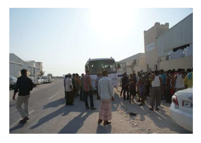
PCSI employees prepare to board a bus to go to the airport, October 2012

In October the company began sending workers home. By mid-November 2012, the company said that 123 workers had been provided with tickets and exit permits to travel home. Eleven of the workers reportedly agreed to stay and continue working for the company.<sup>263</sup>