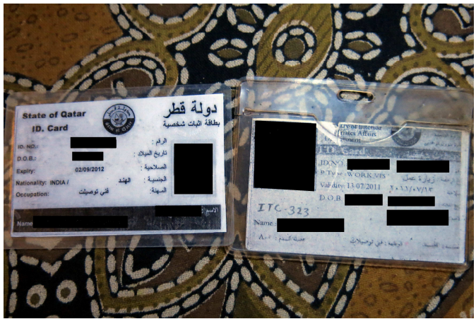
Photocopies of two expired residence permits, which, in March 2013, these men were carrying to show if they were stopped by police. One permit had expired in September 2012, the other in July 2011

"Without an ID we need to think about everything we do. Should I even go out and buy a cup of tea?"210