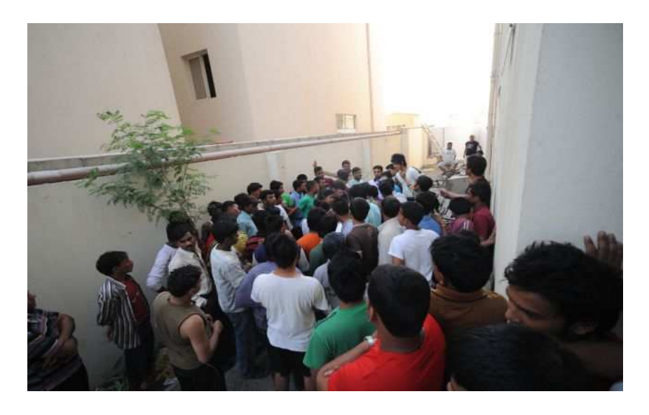
Amnesty International researchers interviewing PCSI employees, October 2012