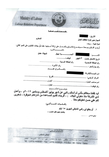
A copy of a labour complaint made to the Labour Relations Department by a migrant worker in 2012

As far as Amnesty International is aware, all Labour Relations Department documents are produced in Arabic only and not translated into other languages, meaning that the vast majority of migrant workers are therefore not able to understand exactly – or at all – what the documents they are given mean. In October 2012 researchers read one complaint form submitted by a Nepalese worker which showed a clear and substantial discrepancy between the information the worker believed he had submitted, and the information which had been recorded on the complaint by the official. 424