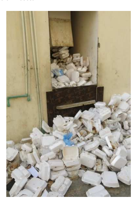
Piles of rubbish were mounting up at the labour camp, apparently because ITC had failed to pay for collection

apparently because the company had not paid for them to be collected, and the piles of rubbish attracted swarms of insects.