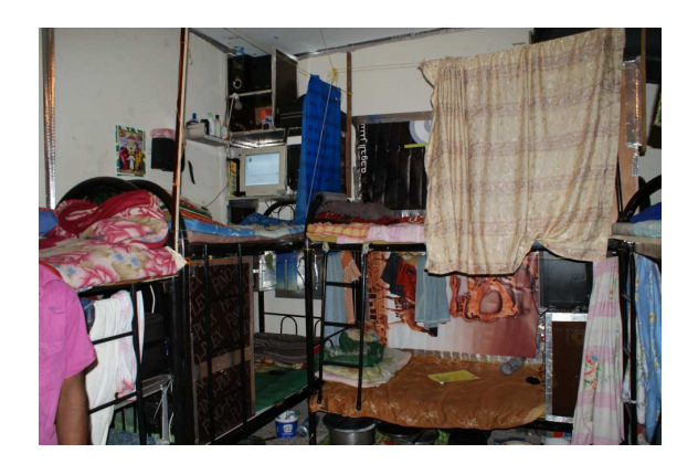
A workers' room in Doha's Industrial Area, October 2012

municipality found workers being forced to sleep in shifts in a villa. ^{161}