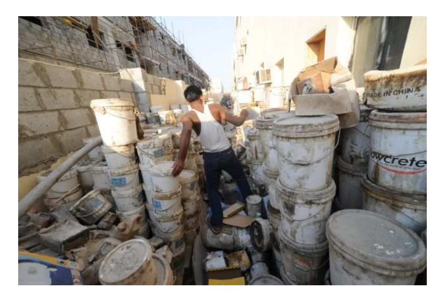
Old paints and construction materials were stored alongside workers' bedrooms and the kitchen, October 2012.