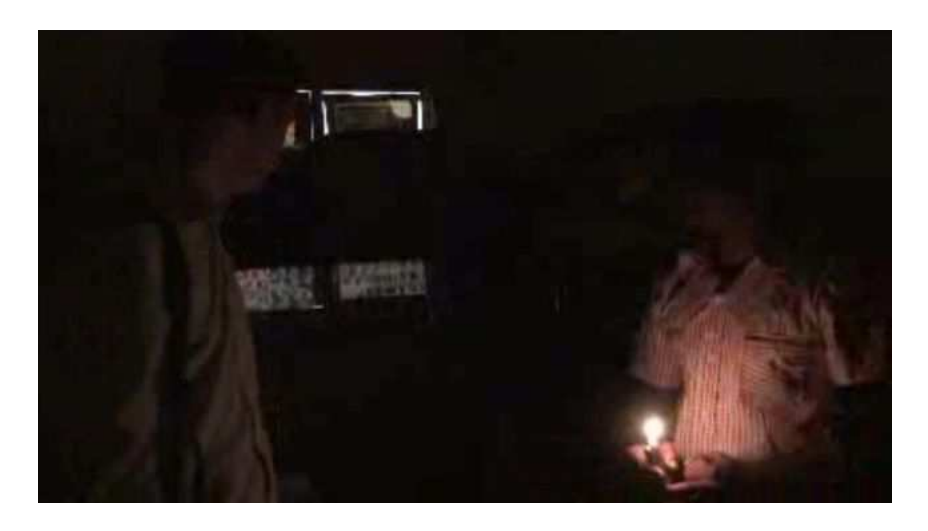
An ITC employee in his room with an Amnesty International researcher, March 2013

Several men told researchers that they had become so desperate to escape these conditions and return home that they had abandoned hope of ever being paid and just wanted to leave. 193