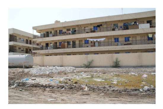
Sewage overflows in the street. Doha's Industrial Area, October 2012

Amnesty International saw several camps in Doha's Industrial Area where sewage had overflowed and stagnant water was flooding the surrounding area. In one camp visited by Amnesty International, the covers of septic tanks were left open with suction hoses connected to a static sewage tanker, creating a strong and unpleasant smell in the area around the accommodation. Amnesty International has seen photographs taken by a member of the local community who assists workers in distress, showing that this cover had been open for weeks before researchers visited the camp.