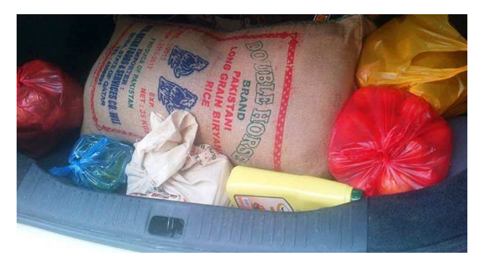
Food being delivered by members of the local community to Krantz workers.

From February 2013, Amnesty International received repeated reports from all three of the Krantz camps of problems with food supply from the company. This problem appeared to get substantially worse from April 2013 and workers reported that the company simply stopped sending food to them. In one employee's contract reviewed by Amnesty International, Krantz had committed to providing his food throughout his employment.<sup>61</sup>