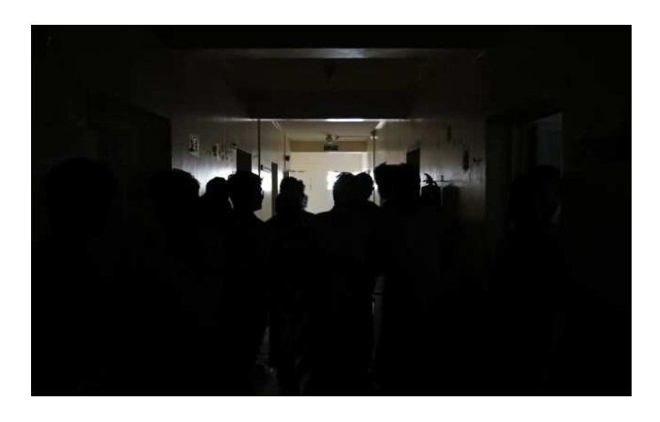
ITC workers stand in an unlit corridor at their accommodation, March 2013

Post on online forum Qatar Living by an employee of Indian Trading and Contracting, a construction firm, 7 March 2013<sup>190</sup>