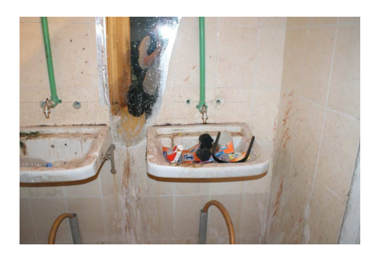
Workers' bathroom without functioning sinks. Doha's Industrial Area, October 2012

Despite the requirement for companies to appoint a member of staff to clean workers' accommodation, workers had to clean their own rooms in all camps visited by Amnesty International. In the majority, it was also left up to them to clean communal areas, despite working long hours in very physically demanding jobs and having only one day off per week. At one camp, workers told researchers that, over a period of two years, there was no cleaning of the accommodation by the company. Amnesty International researchers saw at least four camps where bathrooms and kitchens were not properly maintained, with, for example leaking sinks and pipes.