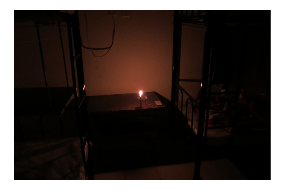
Candle-light in the workers' accommodation, March 2013. When their pay stopped, the workers had been employed on a project owned by one of the world's largest energy companies

When Amnesty International researchers visited the camp on 13 March, there was no air conditioning or lighting and the men were using candles and torches. On 15 March Krantz moved the workers from Al Khor to another camp with power.