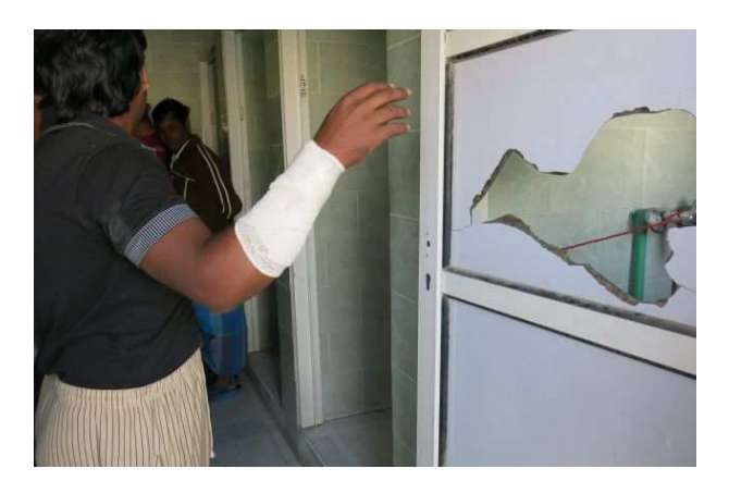
An Indian worker shows the injury to his arm. He told researchers he slipped in the bathroom at night because there were no lights.

The men had to use candles or, if they had been able to charge them elsewhere, the light from their mobile phones, even during the day-time - because the rooms inside the camp did not have enough natural light. Shortly before Amnesty International's visit, one man had slipped in the bathroom as a result of the lack of lighting in the camp at night and fallen against a toilet door, severely injuring his arm. He showed researchers his bandaged arm, which he said had required 38 stitches, as well as the still-broken door.<sup>204</sup> Because there was no running water, the men had been unable to wash the bloodstains from the bathroom floor.