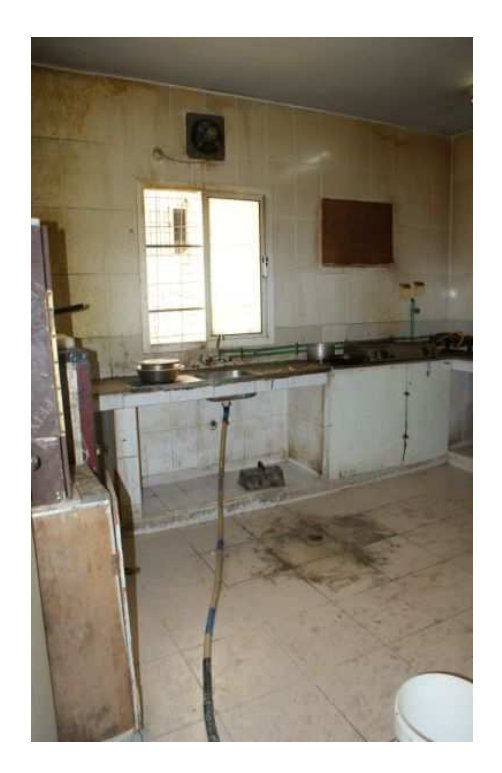
The downstairs kitchen at the PCSI workers' accommodation, October 2012. There is a boarded up hole where an air conditioning unit is meant to be installed, and drainage problems mean that the floor is partially flooded

Amnesty International asked PCSI's General Manager about the overall standard of accommodation. She initially said that the workers' accommodation was "seven star" but later admitted that she had never visited the camp and would "never" go there. Nevertheless she said she thought it met labour law standards. The responses of the General Manager are deeply problematic, as they indicate that she had no proper understanding of the conditions that her employees were living in, nor apparently any desire to learn. Overall she displayed little concern for the fact that the accommodation clearly breached Qatari and international standards.