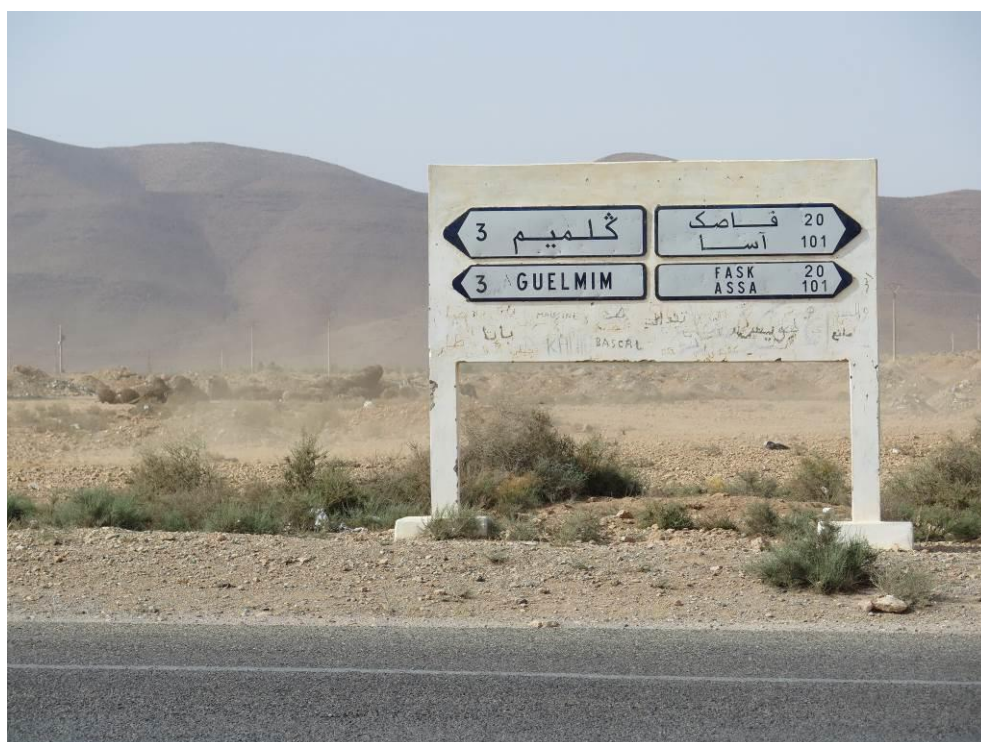
Photo: Junction between Gulemim and Assa, southern Morocco, where reports of protesters being tortured and otherwise ill-treated following arrest by gendarmes and police in September 2013 emerged.

"He was full of bruises. He told me they tortured him the night he was arrested, until he signed, although he was innocent. When he resisted signing, they threw water on him and gave him electric shocks. We went to the police station at the time, but they wouldn't let us see him."