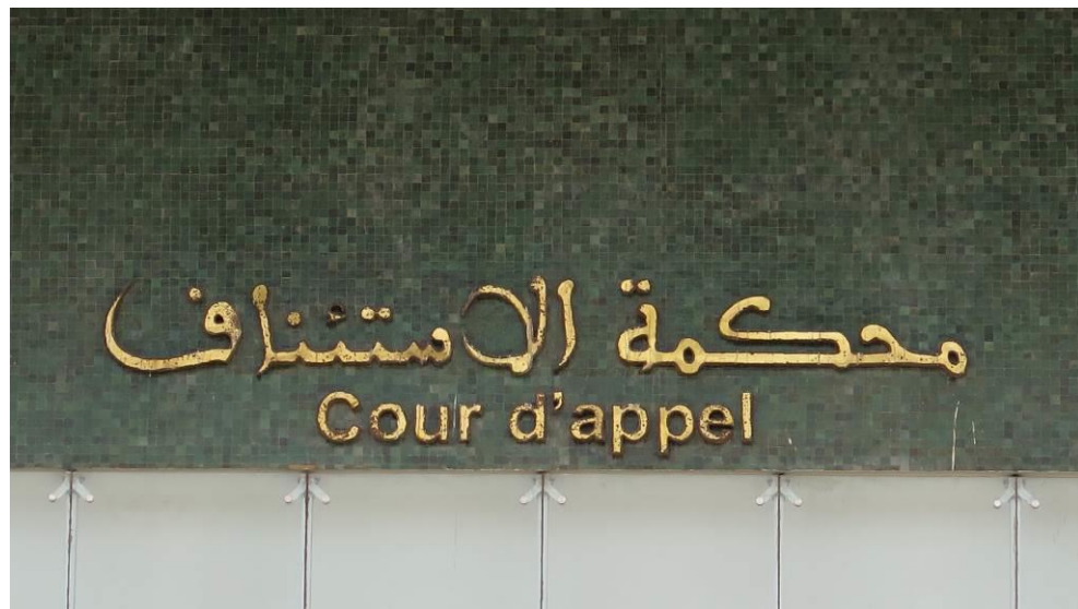
Photo: Agadir Court of Appeals whose landmark ruling in August 2014 overturned a conviction based on a torture-tainted police interrogation report.

In a rare decision, the Criminal Chamber of the Agadir Court of Appeals quashed a guilty verdict for drugs charges against a detainee who alleged torture, in August 2014. The court granted a medical examination which was performed in the Guelmim military hospital. It concluded that he had been tortured in garde à vue detention including though beatings, blows to the head that perforated his eardrum, and cigarette burns, following his arrest in Guelmim in June 2014. Authorities announced an investigation into the alleged torture, and have yet to make conclusions public.