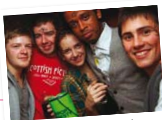
Manchester uni PTH party

16-22 October 2010 www.amnesty.org.uk/protect