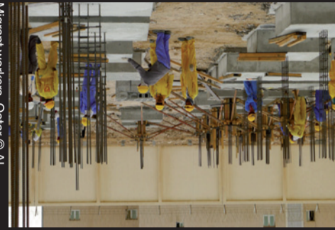
Migrant workers, Qatar

Globalisation has changed the world we live in, with companies that operate internationally gaining unprecedented power and influence in the world economy. Such companies can cause harm by directly abusing human rights, or by colluding with others who violate human rights. In response to this challenge, the United Nations (UN) Human Rights Council adopted the Guiding Principles for Business and Human Rights. These aim to ensure business plays its part in the promotion of human rights. We want to see: • the UN's 'Protect, Respect and Remedy' framework fully adopted by government • Scottish companies, and those with a significant presence in Scotland, encouraged to embrace human rights in their business operations.