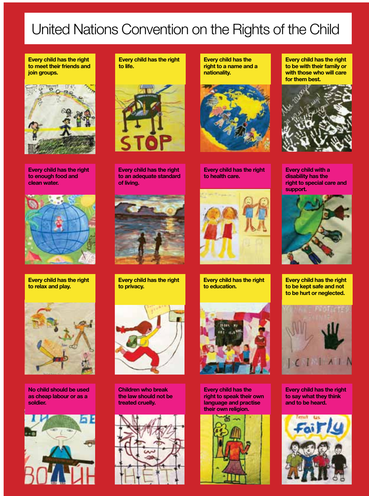
Pictures of children's rights by primary school children from the UK and the Russian Federation.

This is an example of how your children's rights picture quilt could look.