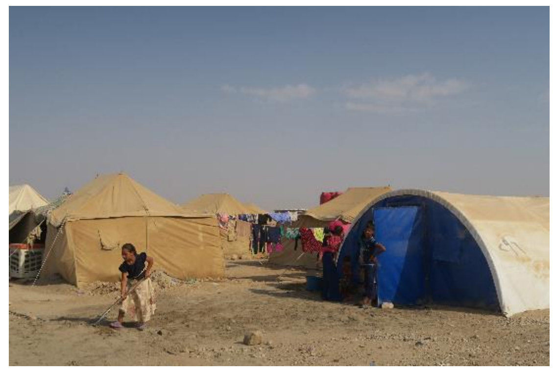
Tens of thousands of refugees from Anbar are sheltering in sprawling camps in Amariyat al-Falluja, Anbar governorate.

Ahead of military operations to retake Falluja and surrounding areas in Anbar governorate in May 2016, the Prime Minister and Grand Ayatollah Ali al-Sistani urged pro-government forces to protect civilians in the course of operations. <sup>22</sup> The Prime Minister announced that operations would be jointly carried out by Iraqi armed forces, the Counter-Terrorism Service, an independent ministerial level security force, <sup>23</sup> the Federal