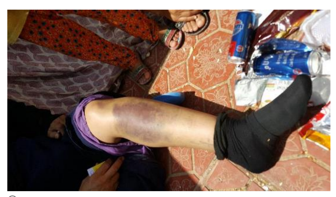
→ Woman displaced from a village in Imam Gharbi to Dibaga camp shows Amnesty International her bruised leg, following a fall during her escape from the armed group calling itself the Islamic State.

The plight of internally displaced persons (IDPs) does not end once they reach territories outside of IS control. Hundreds of thousands continue to live in dire conditions with insufficient or no access to essential services and medical care. Thousands of men and boys, fleeing IS territory, have been rounded up by security forces or militias on suspicion of links to IS. Some have been extrajudicially executed, while the fate of others remains unknown amid concerns for their lives and safety. Thousands more have been locked up, and remain at the mercy of a deeply flawed criminal justice system. Suspects are apprehended without warrant, denied contact with families for weeks or even months, and remain in prolonged detention without referral to judicial authorities for months or even years. Many are tortured, otherwise ill-treated and coerced into "confessions" used as the basis of their convictions in proceedings falling far short of international standards for fair trial. Tens of thousands have been forcibly displaced by central Iraqi forces, forces of the KR-I and militias who continue to prevent them from returning to their towns and villages. Others displaced by conflict more recently are subjected to arbitrary restrictions on movement, making it even harder for them to access basic necessities and essential services.