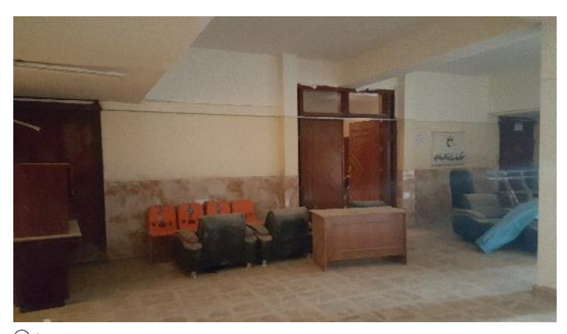
When Amnesty International visited on 2 August, the Ramadi Criminal Court was still under refurbishment following the takeover of the city from IS in December 2015. It is the only Criminal Court in the Anbar governorate.

As prison visits are generally denied in Anbar, most relatives have no concrete information on the legal process or exact charges facing detainees, if any. Most also cannot afford private legal representation. The only news they receive on the status of their relatives generally comes from released detainees.