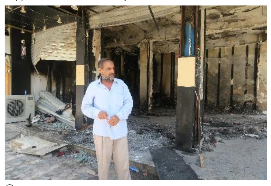
Tather still looking for the body of his son, among the some 300 people killed in the 2 July Karrada neighbourhood bombing in Baghdad. The Iraqi authorities carried out an increasing number of executions since the attack, following public pressure to "punish terrorists".

Despite flagrant violations of due process, including in capital cases, the Iraqi authorities continue to carry out executions. In 2016, the authorities announced 88 executions, while at least 123 people were sentenced to death. The Iraqi authorities have come under increasing political and public pressure to speed up executions, particularly following the deadly attack on Karrada, a shopping district in Baghdad, on 2 July 2016, which claimed nearly 300 lives. In the wake of the attack, the Ministry of Justice announced that seven executions were carried out on 4 and 5 July. It stated that there were up to 3,000 individuals on death row.<sup>85</sup> Amendments were also introduced to Iraq's CCP on 12 July making it more difficult for defendants sentenced to death to seek a retrial. On 21 August, the Iraqi authorities carried out executions of 36 men convicted of the killing of 1,700 military cadets at Speicher military camp near Tikrit in June 2014 after a deeply flawed mass trial which lasted only a few hours and relied on "confessions" extracted under torture.