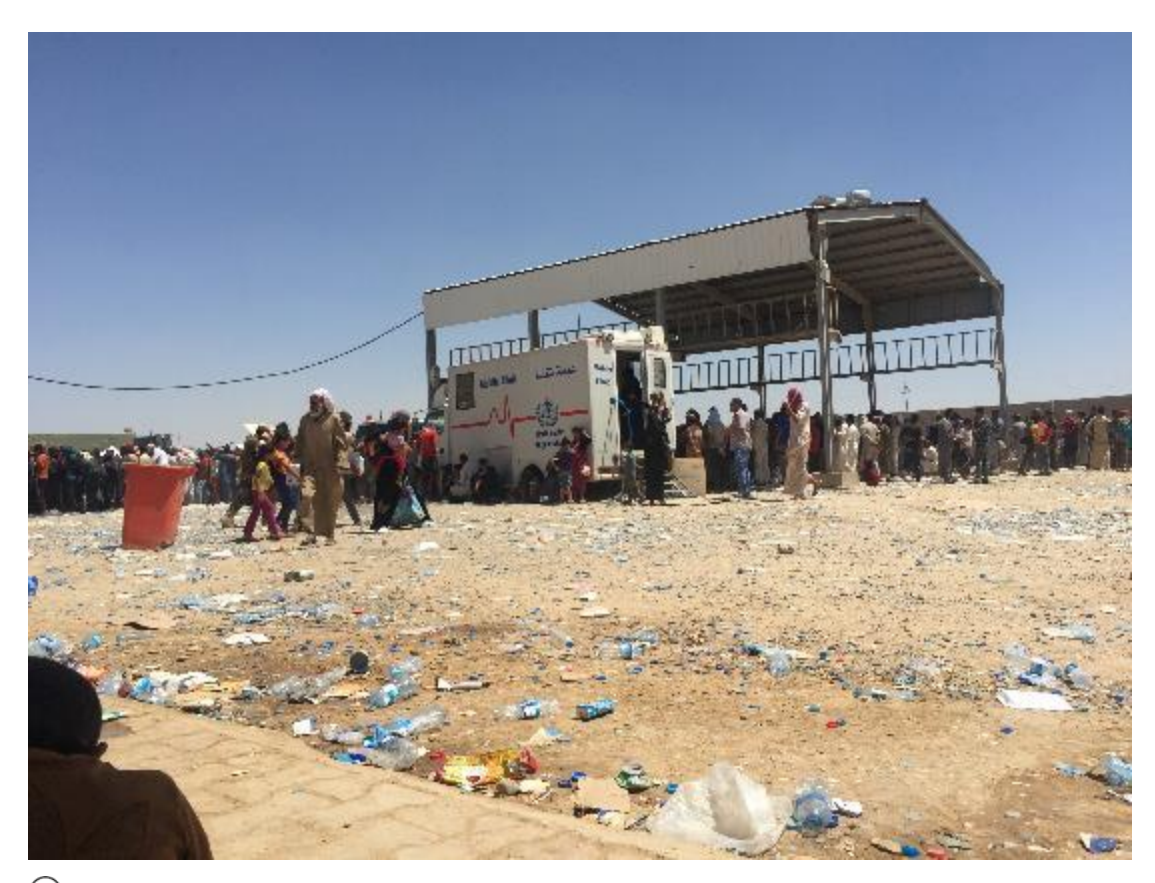
Conditions at the Hajaj transit centre for internally displaced persons, commonly referred to as "Silo", are dire. When Amnesty International visited on 30 July, thousands of men were awaiting security screenings with little protection from the scorching sun.

A man from Imam Gharbi who fled his home on 20 July together with his wife, children and six other families described how his treacherous journey to reach safety ended in security screening: