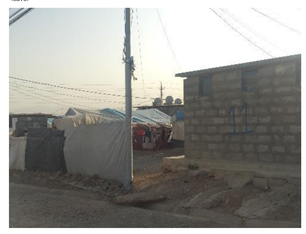
Relatives of those abducted from Salah al-Din are spread out in camps across the country including in Ashti camp in Sulaymaniya governorate and the Salam camp in Baghdad.

Armed men in military uniform carrying Kata'ib Hizbullah flags, according to witnesses, rounded up a number of men from the village of Abu Dhala near the city of al-Dur on 6 March 2015; several remain unaccounted for. Among them is a 48-year-old civil servant in Tikrit, and his two sons aged 16 and 17, both secondary school students. Two other relatives taken at the same time remain missing, while three others were released two and a half months later. The women and children who were in the same house were taken to an empty house between Samarra and al-Dur and were kept there for four days, before being allowed to leave