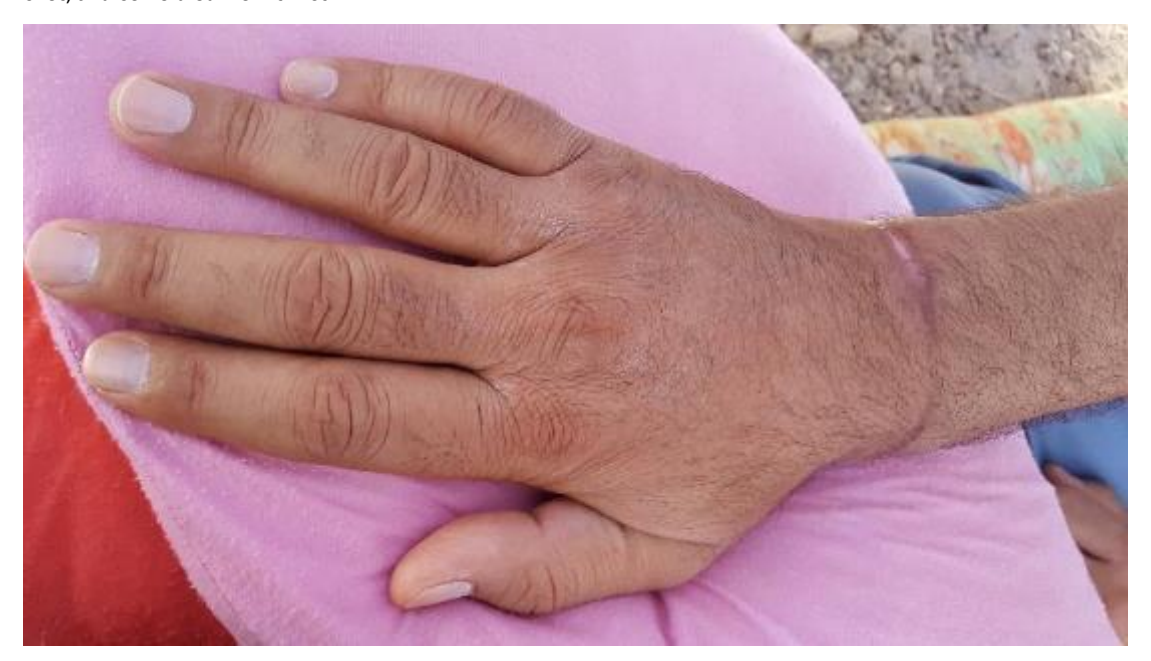
Survivor shows Amnesty International the marks left on his wrist after armed men bound his hands behind his back with a plastic cuff following his abduction on 3 June in Saqlawiya. He told Amnesty International that he was hit with cables, shovels and metal bars and witnessed other detainees die under torture.

"We were nine brothers separated from our families and initially taken to a garage in Shuhada. Five of us came out alive, and four have since disappeared... My missing brothers [aged between 22 and 46] were taken away in the first transports... I try to be strong for their families and tell them not to lose hope and keep praying, but I am afraid, especially after what happened to us in the 'yellow house'. People died from beatings; others were shot; and some died from thirst." 33