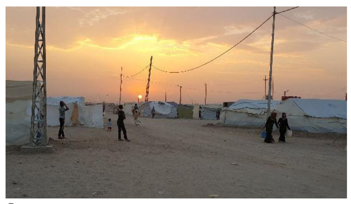
Some 3.4 million Iraqis continue to be displaced and are currently sheltering with host communities as well as in camps for internally displaced persons, schools, mosques and unfinished buildings. Some 87,000 people fled fighting in Falluja and surrounding areas in May and June 2016, sheltering in sprawling camps in Amariyat al-Falluja.

IS crimes and the ongoing armed conflict have led to mass internal displacement. Though repeated bouts of sectarian strife since 2003 have forced many civilians from Iraq's diverse ethnic and religious communities from their homes, <sup>15</sup> the scale of the displacement since the 2014 takeover by IS of large parts of the country is unprecedented. Over 4.2 million Iraqis have been forced to flee their homes since January 2014, <sup>16</sup> and some 3.4 million continue to be displaced and are currently sheltering with host communities as well as in camps for internally displaced persons (IDPs), schools, mosques and unfinished buildings. Many live in dire conditions, and have little or no access to essential services and medical care. <sup>17</sup> Thousands of residents of Mosul and surrounding areas have also fled across the border to Syria and are living in the Hol Camp. <sup>18</sup>