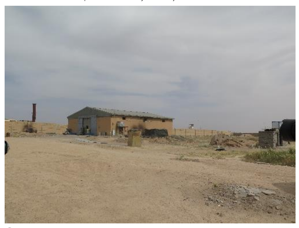
The makeshift detention facility known as Munsha'at (Installations) is used for security screening of internally displaced persons in Amariyat al-Falluja, Anbar governorate.

Survivors were handed over to local officials from Anbar and transported to the makeshift detention facility at Munsha'at (Installations) in Amariyat al-Falluja for security screening. Several local officials who saw the survivors once they were handed over described to Amnesty International their shock at the sight of the bloodied and bruised detainees, some of them unable to stand or walk. Three bodies were also handed over, while a fourth victim died upon arrival in Amariyat al-Falluja.