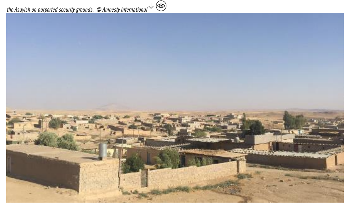
\textcircled{ } \uparrow_{\textit{Chergana village.}}

A 65-year-old woman from a village near Wana who has been sheltering in Garmawa camp since early 2015 told Amnesty International that in August 2016 she obtained a seven-day permit to visit her relatives in Wana but that when she arrived at the Taibe checkpoint she was first refused passage by Asayish officers and then told she could only go for two days. "So I went for only two days. What could I do? I had not seen my sister for a year," she told Amnesty International.