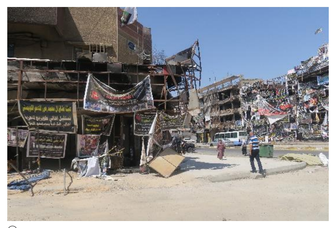
The bombing of the busy neighborhood of Karrada on 2 July claimed some 300 lives. Following the tragedy, the Iraqi authorities came under increased pressure to execute those convicted of terrorism-related offences.

frequently targeted predominantly Shi'a neighbourhoods and religious shrines including during busy times of the day in an apparent attempt to cause maximum civilian damage, further enflaming sectarian tensions.