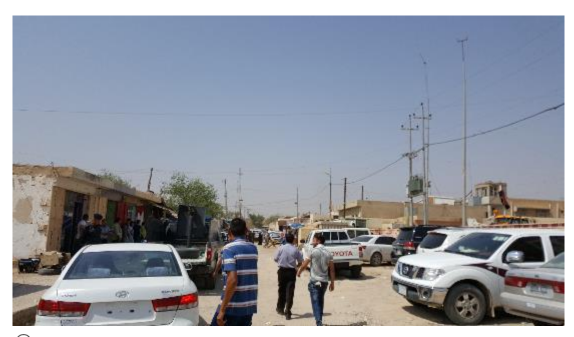
Tentrance to Khaldiya court, where the head of the court told Amnesty International that only two investigative judges were reviewing the detention of all those held on suspicion of links to IS. When Amnesty International visited on 2 August, the court complex was crammed with people. The court is one of the three functioning investigative courts in Anbar governorate.