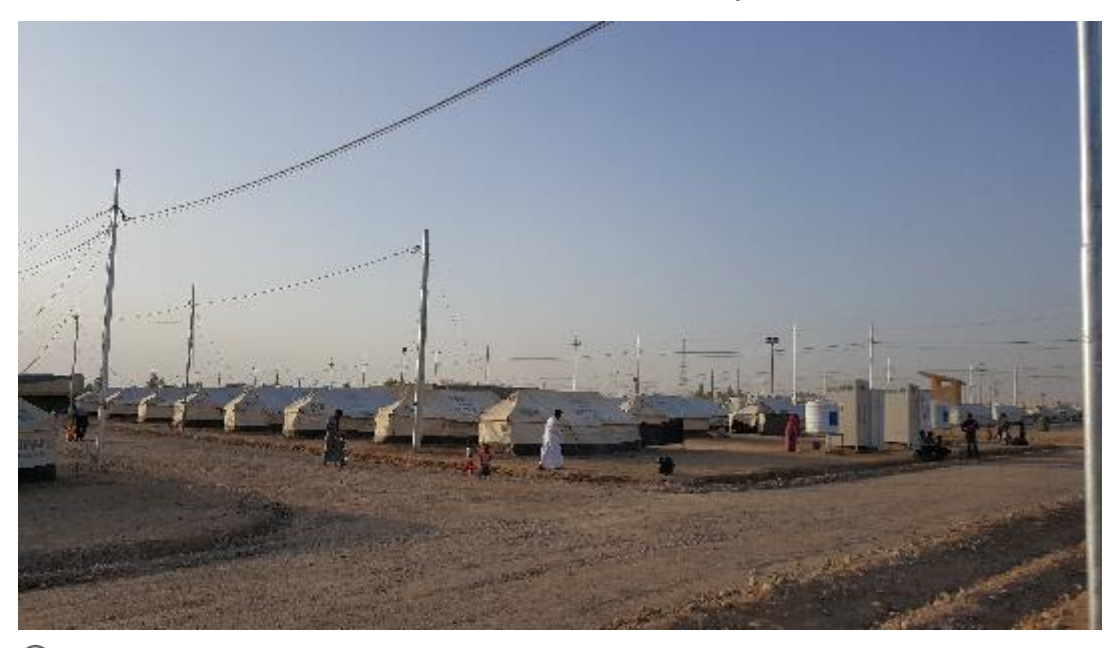
DPs in Nazrawa camp cannot go to Kirkuk, some 20 km away, without having a local sponsor, a civil servant job or property in the city. Several of those living in the camp have detained relatives on suspicion of links to IS, but were unable to visit them due to restrictions on their freedom of movement.

"I am here in the camp with my four children. I don't know who to ask or where to go. We fled from Daesh hoping for a better life, but now I am left with no husband, no home, and no money." 66