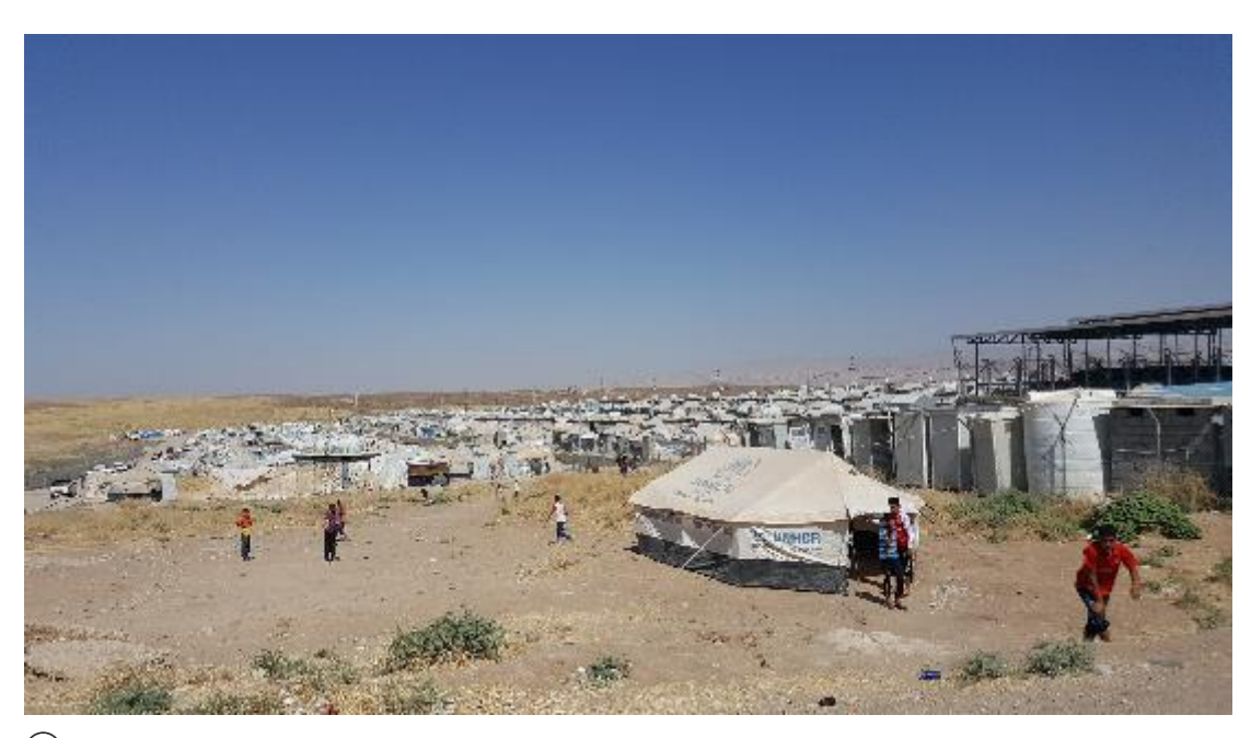
DPs at Garmawa camp told Amnesty International that they not permitted to return to their villages including Chergana, a five-minute drive from the camp, by