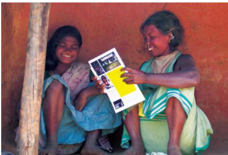
Dongria Kondh women with Amnesty International material

In the last few years Vedanta's operations have been under increased scrutiny. In response to the resulting pressure from bank lenders and investors, the company has recently developed a human rights and sustainability policy and published a report entitled 'The Lanjigarh Development Story: Vedanta's Perspective'. Although these recent developments demonstrate the strength of Amnesty's influence (Vedanta directly refers to Amnesty in its report), Amnesty believes that these policies fail to address the persistent human rights concerns associated with the company's operations in Orissa.