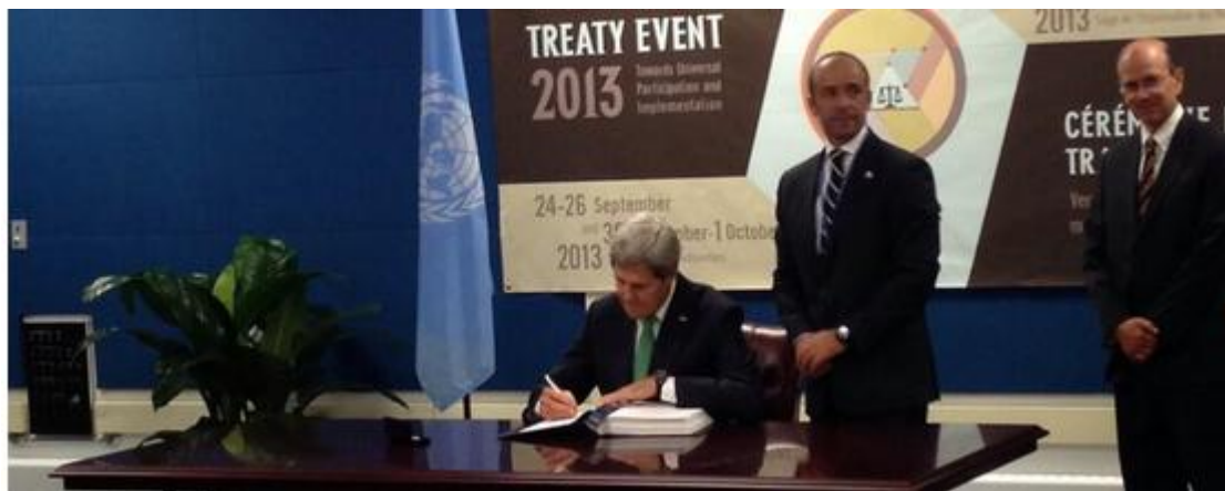
John Kerry (US Secretary of State) signs Arms Trade Treaty

On 25 th September the USA took the crucial step of signing the Arms Trade Treaty (ATT). As one of the world's leading arms exporters, this is encouraging and will add to the pressure on other countries who have yet to sign the treaty, including China and Russia.