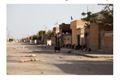
A street in the abandoned town of Tawergha. September 4, 2011.

Amnesty's campaign aim is for the Tawarghas to be able to safely return home. The plight of the Tawarghas reflects wider human rights abuses in Libya. Amnesty calls on the National Transitional Council to end abuses by armed militias in Libya including arbitrary detention and torture. We will be taking action by writing letters to the Libyan Ambassador and sending faxes to Ali Hmeida Ashur, the Minister of Justice and Human Rights in Libya. Jill