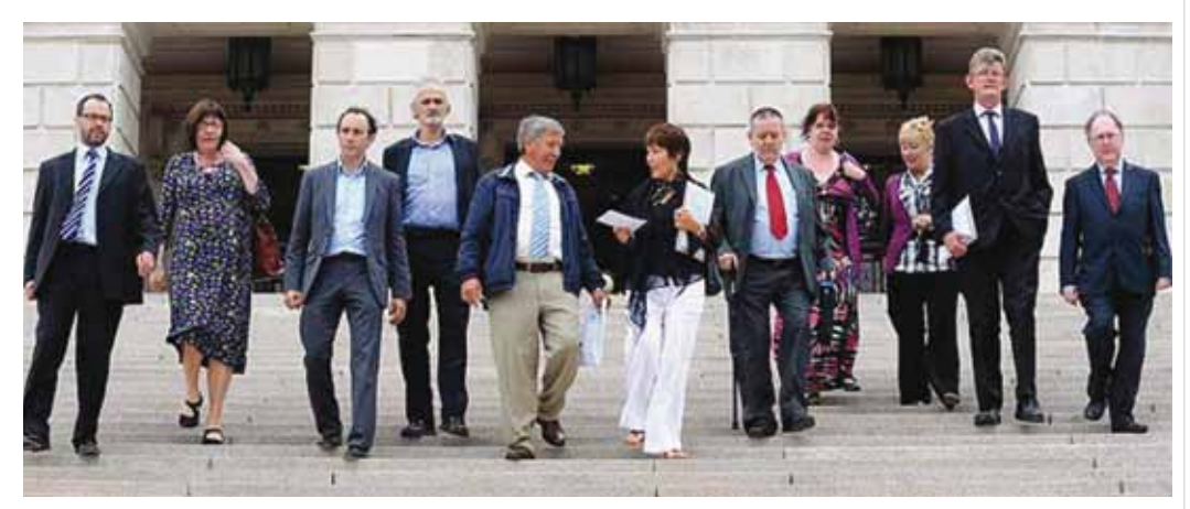
Survivors and campaigners take their campaign to Stormont