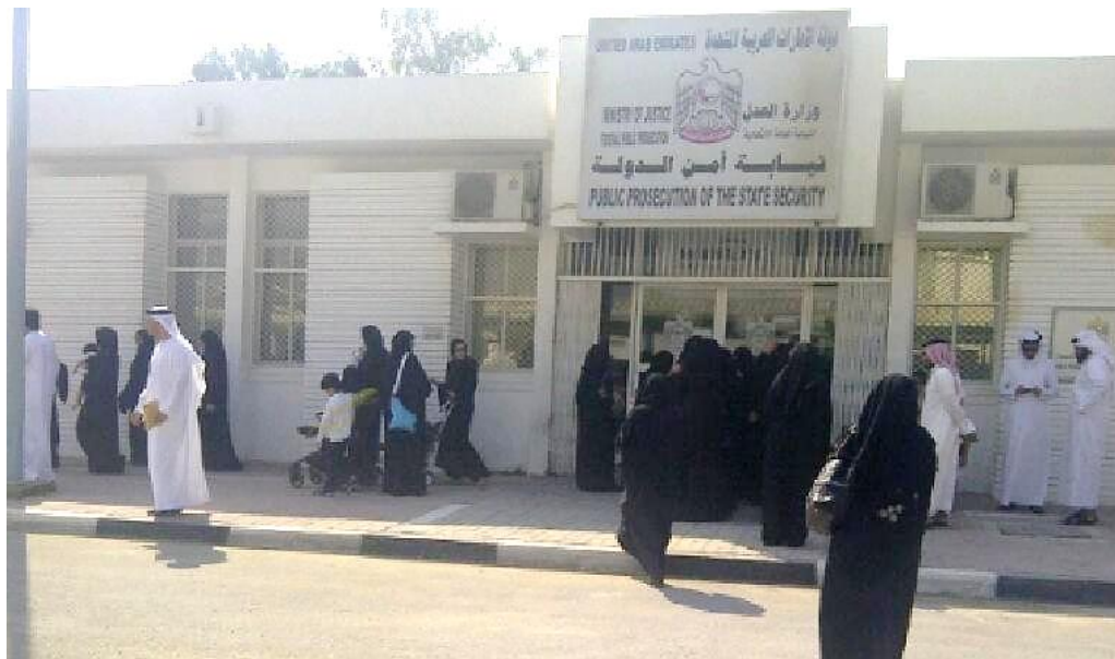
Families of detainees gather at the State Security Prosecution office in Abu Dhabi in November 2012 to seek information about their relatives.