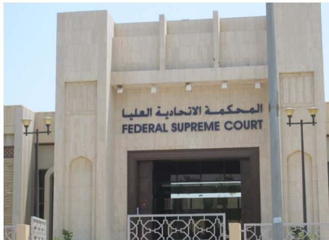
Federal Supreme Court, Abu Dhabi, UAE.

The Federal Supreme Court, whose judges are appointed by executive decree, has shown itself to be neither independent nor impartial when trying cases brought largely under broad and sweeping national security provisions in the Penal Code or the cybercrimes or counter-terrorism laws. Trials