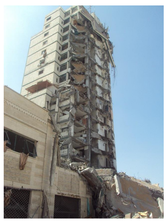
Italian Complex in Gaza City, Gaza Strip, August 2014

On 25 August 2014, at about 12.05am, an Israeli aircraft launched a number of bombs at the Italian Complex, built in a joint venture with an Italian company. Munitions experts consulted by Amnesty International identified one of the bombs as probably a Guided Bomb Unit (GBU) equipped with a Joint Direct Attack Munitions (JDAM) system.<sup>36</sup> The complex, which contains a 16-storey tower with a commercial centre on the two bottom floors, was severely damaged when all the floors on one side of the tower collapsed.