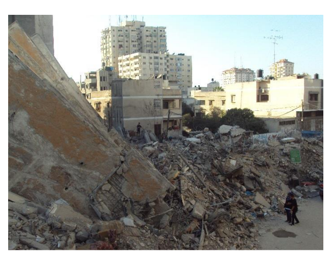
Al-Basha Tower in Gaza City, Gaza Strip, August 2014

"His face was very pale and he was very frightened. He said he had just received a call [from the Israeli army] that the tower had to be evacuated and that it would be targeted in 20 minutes. I didn't know what to save; we had to wake up all the people sleeping upstairs."<sup>47</sup>