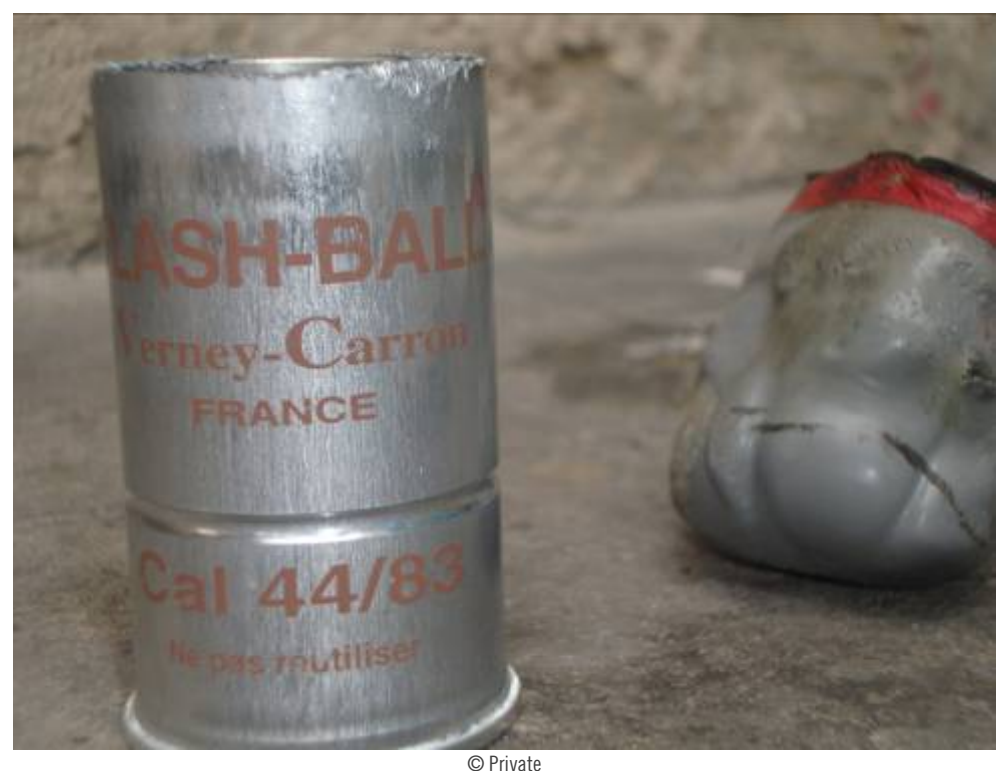
On the left of the photo is an empty Flash-B-all cartridge case that was fired into the compound of a human rights defender in Kinshasa on 23 December 2011 along with tear gas, and on the right a remnant of a distinctive 56mm French-manufactured tear gas grenade (grey with red band).

The 44mm Flash-Ball cartridges contain a large, soft rubber ball projectile which, according to the company's brochure, "has the stoppage power of a .38 Special"<sup>129</sup> - equivalent to a cartridge fired from a revolver, but without penetrating the body. In France, Amnesty International has criticized the lack of adequate training<sup>130</sup> of French police officers in the use of these types of "less lethal" weapons, which will be widely deployed in 2013.<sup>131</sup> In a 2010 report, the French National Commission of Security Ethics recommended that the use of these weapons be reviewed because of several serious accidents resulting from their use in recent years. In the opinion of the Commission, shots fired by the "Superpro" Flash-Ball pose a problem with regard to "both the seriousness and the irreversibility of the manifestly inevitable collateral damage they cause"<sup>132</sup>; it said it was concerned by the "totally disproportionate level of danger in terms of the purposes for which it was conceived".<sup>133</sup>