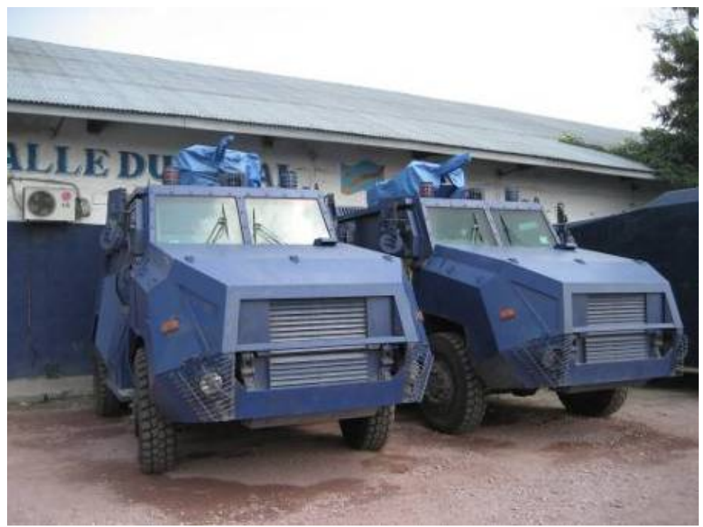
Anti-riot armoured vehicles photographed at the riot police headquarters in Kinshasa on 23 February 2012

China has supplied several types of military trucks and armoured vehicles to the DRC. It is not known exactly when the distinctive blue anti-riot armoured vehicles photographed in use by riot-police during the election violence in December 2011 were delivered to the DRC. This type of armoured vehicle is designed and manufactured by Poly Technologies, a subsidiary of the China Poly Group Corporation, a defence manufacturing and trading company with headquarters in Beijing, China.<sup>121</sup> The vehicle was presented for the first time at the IDEX 2009 Defense Exhibition in Abu Dhabi, United Arab Emirates.<sup>122</sup>