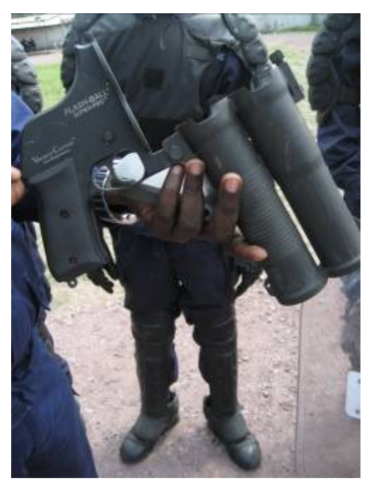
A Verney Carron 'Super-Pro' model Flash-Ball Gun photographed at the police station in Kinshasa, February 2012.