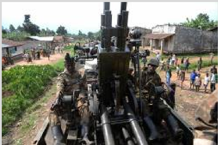
A fighter from the National Congress for the Defence of the People (CNDP) rebel group looks at weapons captured during fighting with the Congolese army in Rumangabo, 17 October 2008.

mortar launch tubes, small arms and ammunition as well as a truck mounted with guns.<sup>50</sup>