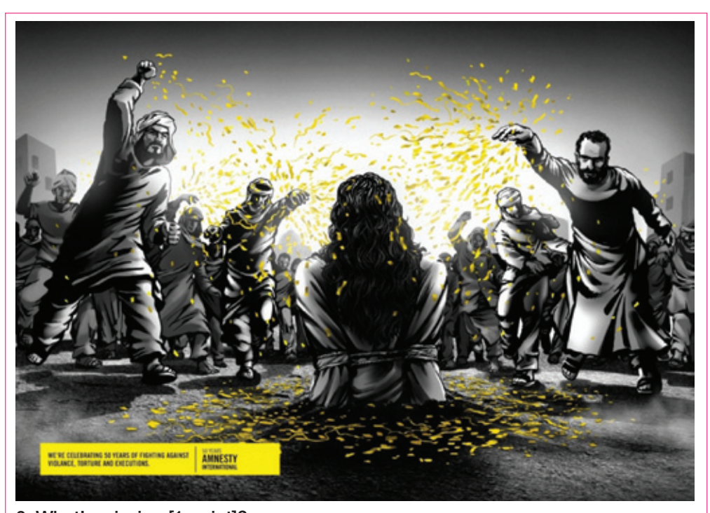
6. What's missing [1 point]?

5b. Amnesty has called for the arrest of all but one of them. Who? [1 point]