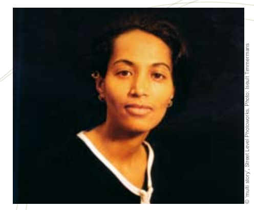
provision of more accessible, co-ordinated and good quality services.

To assist in this process, the Scottish Refugee Integration Forum was established in January 2002 with the remit to develop action plans to enable the successful integration of asylum seekers and refugees in Scotland and the