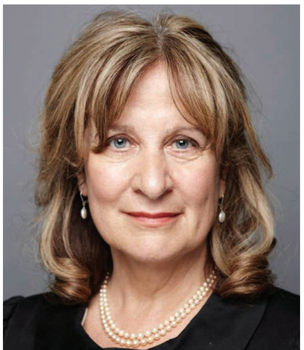
Baroness Helena Kennedy QC

I am hoping that Scotland will pioneer a zero-tolerance approach to human trafficking, leading the way with new strategies, legislation, and the kinds of multi-agency cooperation that enables both the punishment of the traffickers and the identification and recovery of the victims; all underpinned by a comprehensive public awareness campaign about the true nature of this egregious human rights abuse.