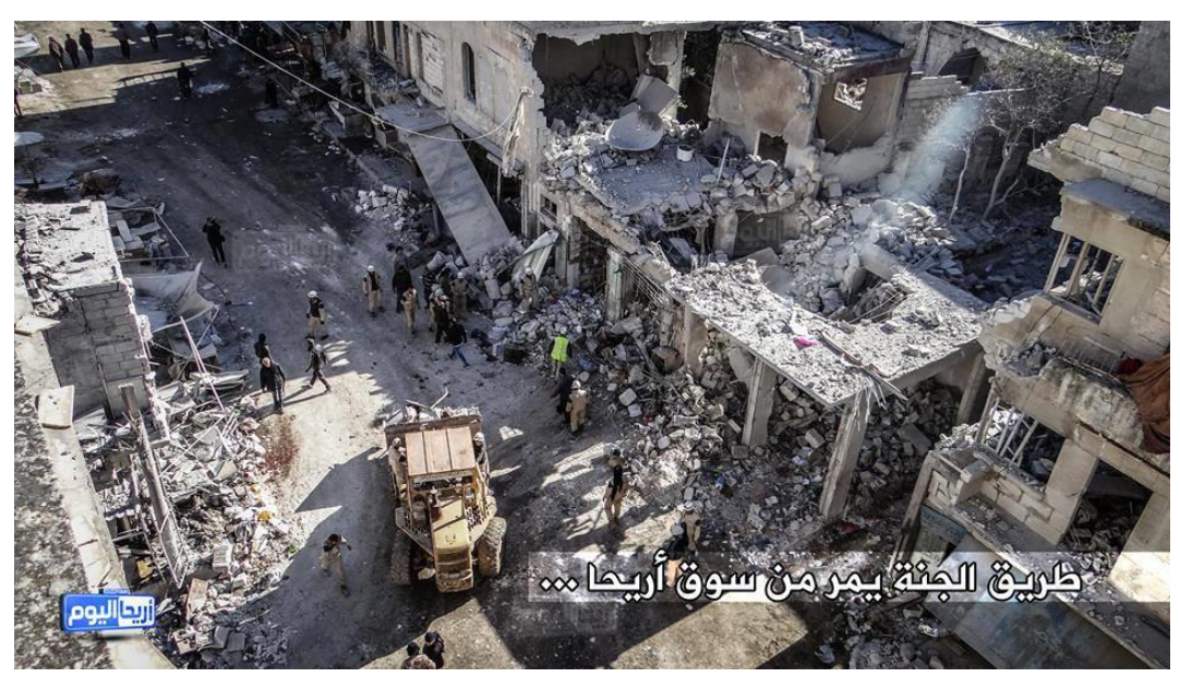
Damage to Ariha market area after 29 November 2015 air strike.

A second activist, "Abu Diab" 39, told Amnesty International: