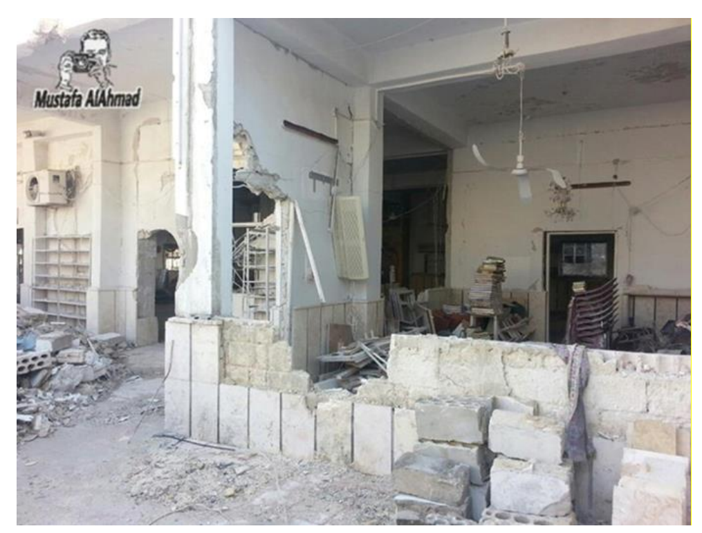
Image of the Omar Bin al-Khattab mosque in Jisr al-Shughour, which was hit by an air strike on 1 October 2015

On 1 October 2015 a Russian Ministry of Defence spokesperson stated that Russia's air force had targeted IS infrastructure and had destroyed one such command post in Jisr al-Shughour.<sup>23</sup> On 30 October, following the emergence of reports and images showing that the Omar Bin al-Khattab mosque had been destroyed, Colonel-General Andrey Kartapolov stated that such information was a "hoax" and presented a satellite image claiming that the mosque was still intact.<sup>24</sup> However, the satellite image showed a different mosque, not the one destroyed in the attack.