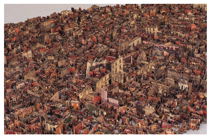
Beat Klein & Hendrikje Kühne Property (Detail) 1999