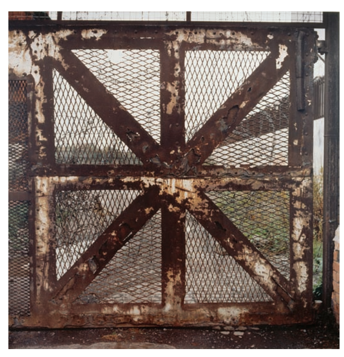
Paul Seawright Gate 1997