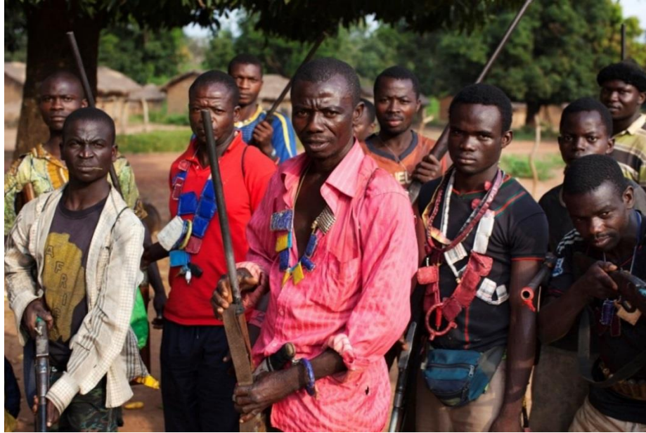
Anti-balaka militia fighters in Mbakate village, Central African Republic. © Reuters, 25 November 2013.

Neither the election of the Transitional President Catherine Samba-Panza, nor the presence of MISCA and French forces, stopped the Anti-balaka from attacking the Muslim population in Bangui and in western CAR. The slow response of the Transitional authorities and international peacekeeping forces to tackle the atrocities of the Anti-balaka, allowed the armed group to assert their authority in many parts of the country, including in Bangui, and increase their capacity to commit further violence.