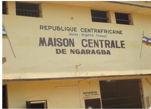
Ngaragba Prison in Bangui, Central African Republic.

These incidents happened despite the presence of the AU-led MISCA forces 32 guarding the prison, which is located close to the official residence of the country's Transitional President. The detention on 16 February 2014 of 11 suspected Anti-balaka commanders at the same prison was seen by many as a sign of hope that the judicial system was starting to work in the country. But on 6 March, 10 of these detainees forced their way out of the prison. MISCA troops and members of the CAR gendarmerie guarding the prison didn't take any action to stop them. According to several eye witnesses including prison personnel, these individuals were not armed and passed in front of the MISCA and the gendarmes before boarding public transport buses and taxis in front of the prison's gates.