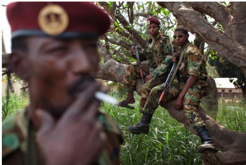
Séléka fighters wait as their commander meets with Multinational Force of Central Africa (FOMAC) peacekeepers at the FOMAC camp in Bossangoa. © Reuters, 25 November 2013.

Currently, the north-eastern part of the country is under the rule of the Séléka and armed Peulhs cattle herders. Both groups are still committing serious human rights abuses on territories under their control. In addition, around 700 combatants led by the Chadian rebel Baba Laddé have joined the Séléka. 106