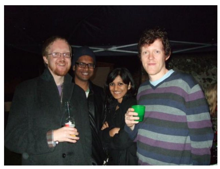
Brighton and Hove Amnesty members sheltering from the rain and enjoying a drink at the Summer Social.

And after covering all of our expenses we raised £57 for Amnesty!