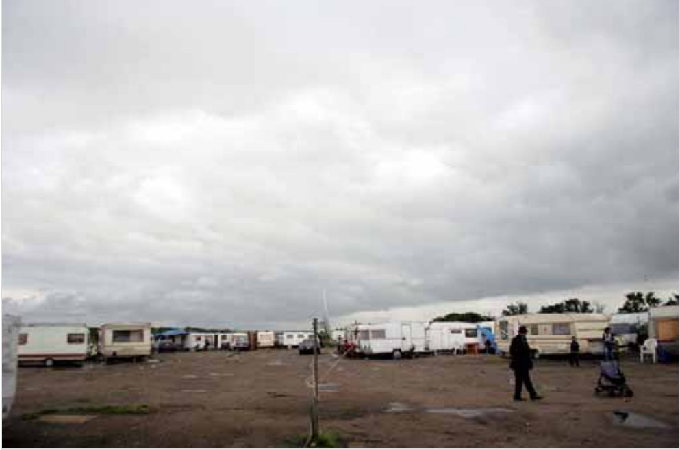
Informal settlement in Triel-sur-Seine.

A series of forced evictions had led the families living in the informal settlement in Triel to settle further and further from the main road, nearly two kilometres down a dirt road from the nearest source of water. The assistance of a voluntary support committee had helped them to register the children in school, but many obstacles remain.