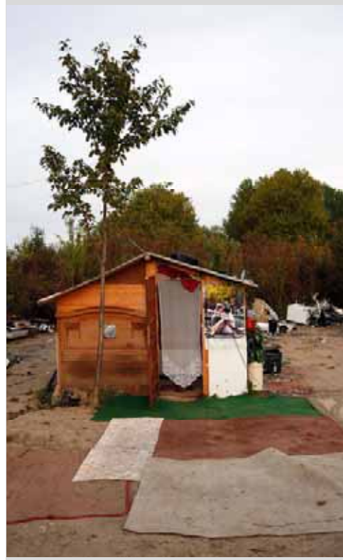
Makeshift home in an informal settlement in Ris-Orangis

Forced evictions are a violation of human rights and have been defined as the removal of people from the homes or land they occupy, against their will and without appropriate legal protections and due process.<sup>2</sup> Under international law, evictions may only be carried out as a last resort, and only after all feasible