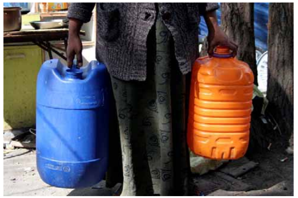
Containers used for collecting water in Noisy-le-Grand. Many camps are located far from the nearest source of water, © Amnesty International.

Housing conditions and other aspects of the right to adequate housing, in informal Roma settlements in France have also been condemned by the European Committee of Social Rights.<sup>153</sup> (see Chapter 2.2)