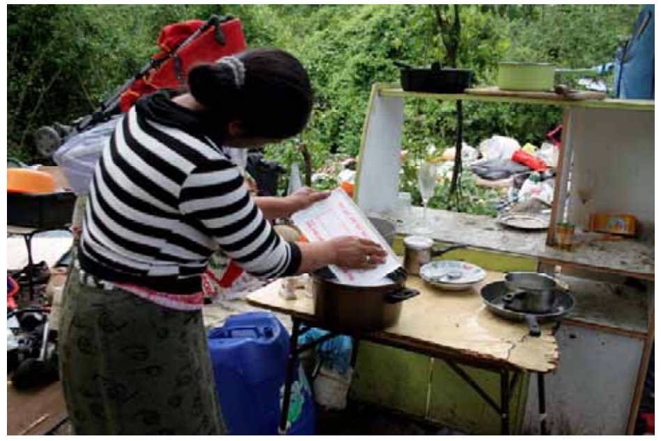
Woman washing dishes near uncollected rubbish in Noisy-le-Grand.

The poor conditions in the informal settlements were one of the most frequently cited grievances of residents there. "At least we want water, electricity, so that we can live in a clean place [...]I want to live on a piece of land where there are rubbish bins, and water even if it is a bit far, we don't mind, we can go and get it. We just want things to be a little bit better. We don't want to live in this misery anymore. We too like to live in cleanliness," Teodor, a resident in an informal settlement in Noisy-le-Grand, told Amnesty International.