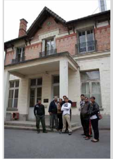
Family awaiting a court decision on their eviction from a camp in Sucy-en-Brie, France.

Around 30 Roma from the same family, including many children, from Bucharest, Romania, have lived in a disused warehouse site in Sucy-en-brie, a town in the southeast of the Paris region in the Val-de-Marne department (94), since October 2011. The family has been able to make many improvements to the abandoned warehouse space, where they have the support of a voluntary support committee. They worry that following an eviction, they will be rendered homeless, and forced to start again, likely in worse conditions.