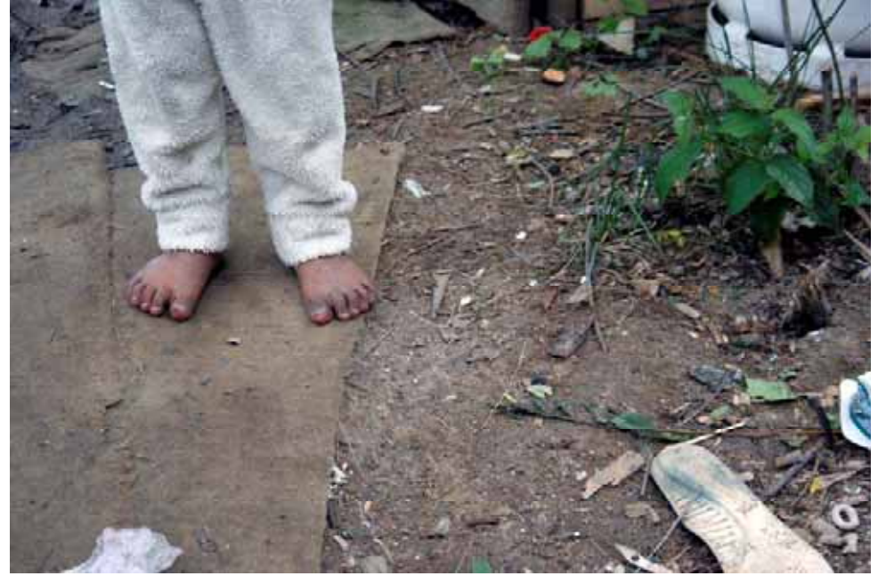
Conditions in camps, such as this one in Noisy-le-Grand, pose risks to health and education.

The 26 August 2012 circular on anticipating and accompanying operations of evictions of unauthorized settlements (see Section 1.1) encourages Prefects to be particularly attentive to access to vaccination and pre-natal care. However under French law, there is no obligation for the prefect to suspend an eviction due to health concerns, even when a serious and contagious illness such as tuberculosis has been identified, so it remains to be seen what these guidelines will mean in practice.