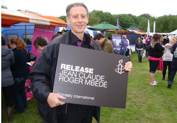
Peter Tatchell at Oxford Pride

Oxford Mela, Saturday 9 th June, Oxford Spries Academy. The Asian Mela was a great way to reach out to Oxford residents who had never heard of Amnesty and enabled us to enjoy some quality Indian entertainment.