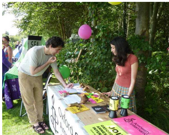
Elderstubs was hot enough to wear sandals

Charlie's contact details are on page 2.