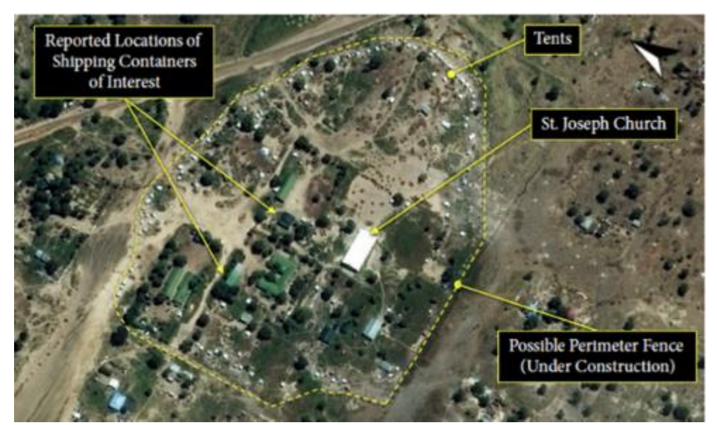
Satellite image of the Comboni Catholic Church compound where detainees were held by government forces.

Witnesses most consistently told Amnesty International researchers that they saw the detainees who subsequently died being held in the red container on the side of the compound used by the Comboni Sisters. The then-commissioner of Leer County, who was not present in Leer during the incident, told Amnesty International researchers that he subsequently requested an internal report about the killings. He told Amnesty International researchers that he was told the detainees who died were held in the red container on the Comboni Sisters side of the compound. Some witnesses however, said that the detainees who died were in a blue container or in a red container on the Brothers' side of the compound. All of the containers that witnesses described did not have any visible air holes or ventilation systems. Amnesty International was not able to determine whether the detainees who died were held in different containers on the church compound, but it is clear that at least some of these detainees died in the red container on the Sisters side of the church compound.