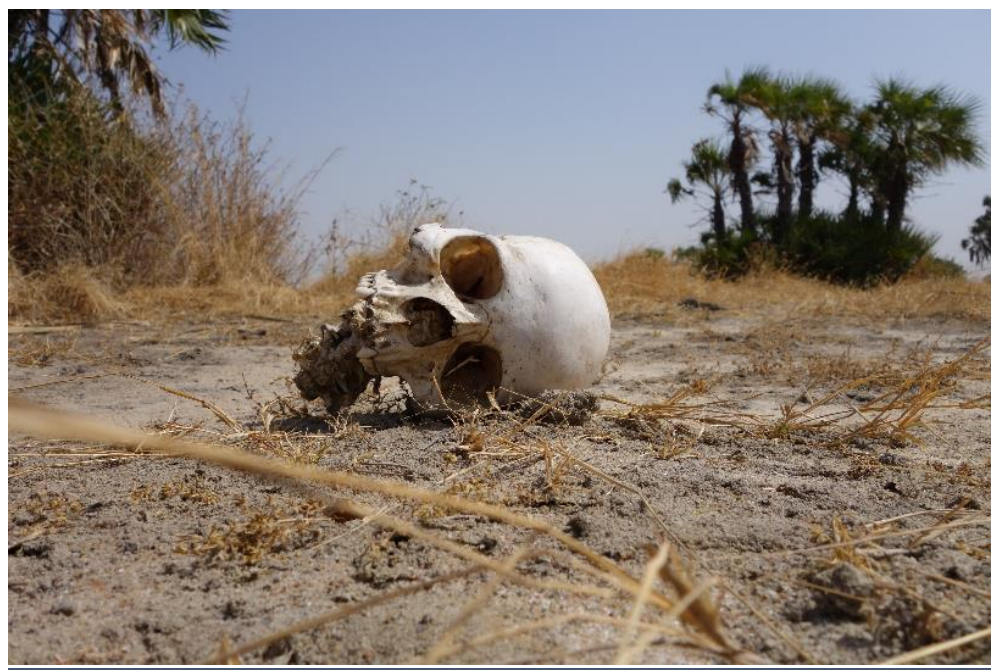
Human remains at the Kulier site found by Amnesty International.

Amnesty International researchers visited Kulier in Joung payam where witnesses said the bodies of the deceased were dumped by government forces in two pits. Amnesty International researchers observed human remains at the site. Remains were strewn outside of the pits identified by witnesses, very likely having been dragged there by scavenging animals.