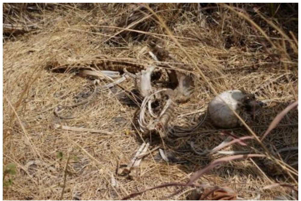
Human remains at the Kulier site found by Amnesty International.

Amnesty International commissioned a forensic analysis of the images of the remains taken by Amnesty International researchers in Leer on 11 February 2016. The forensic analysis was consistent with witness statements regarding the time of death and decay and the evidence of scavenging.