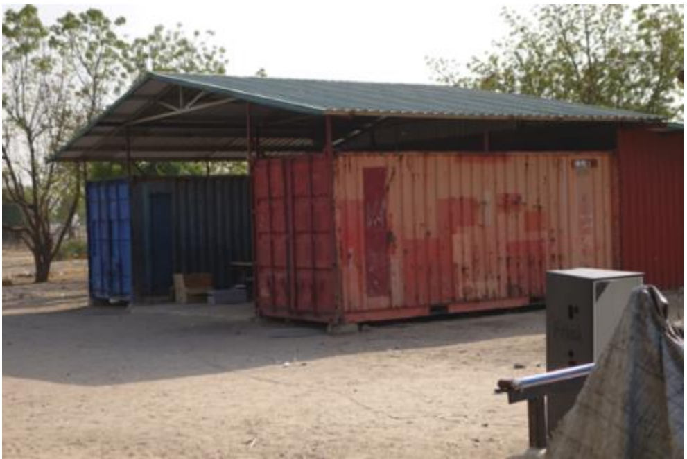
Two shipping containers in the Comboni Catholic Church compound seized by the government in Leer town, Leer County, Unity State. The red container was repeatedly identified by witnesses as the one used by government forces to hold detainees in October 2016 until they died from suffocation. Amnesty International, 11 February 2016.

Amnesty International researchers observed four shipping containers in the Comboni Catholic Church compound. Two shipping containers, one red and one blue, were positioned next to one another, a short distance apart on the Comboni Sisters' side of the compound. The containers are under a tin roof and behind them there is a small rectangular office which witnesses described as the then-area commander's office.