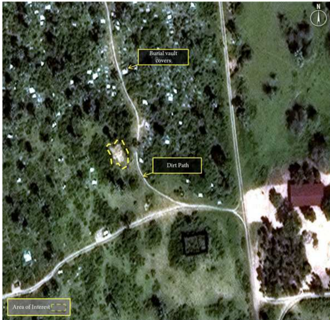
Satellite image showing disturbed earth in the Buringa area, which is consistent with witness accounts and video footage of mass graves.

A review of satellite imagery and video footage of the suspected mass burial site shows undisturbed and intact grass surrounding the site, suggesting that the grave was dug with simple hand equipment such as shovels.