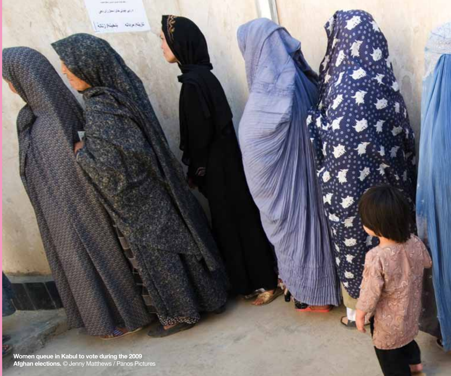
Women queue in Kabul to vote during the 2009 Afghan elections.