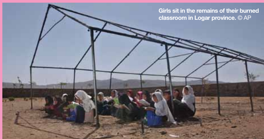
Girls sit in the remains of their burned classroom in Logar province.

The Afghan government has said that Taliban fighters who take part in reconciliation must renounce violence, cut ties with al-Qa'ida and accept the principles of the Afghan constitution, which forbids discrimination and states that men and women are equal before the law. The constitution also guarantees the right of education for all Afghans and the political representation of women in parliament.