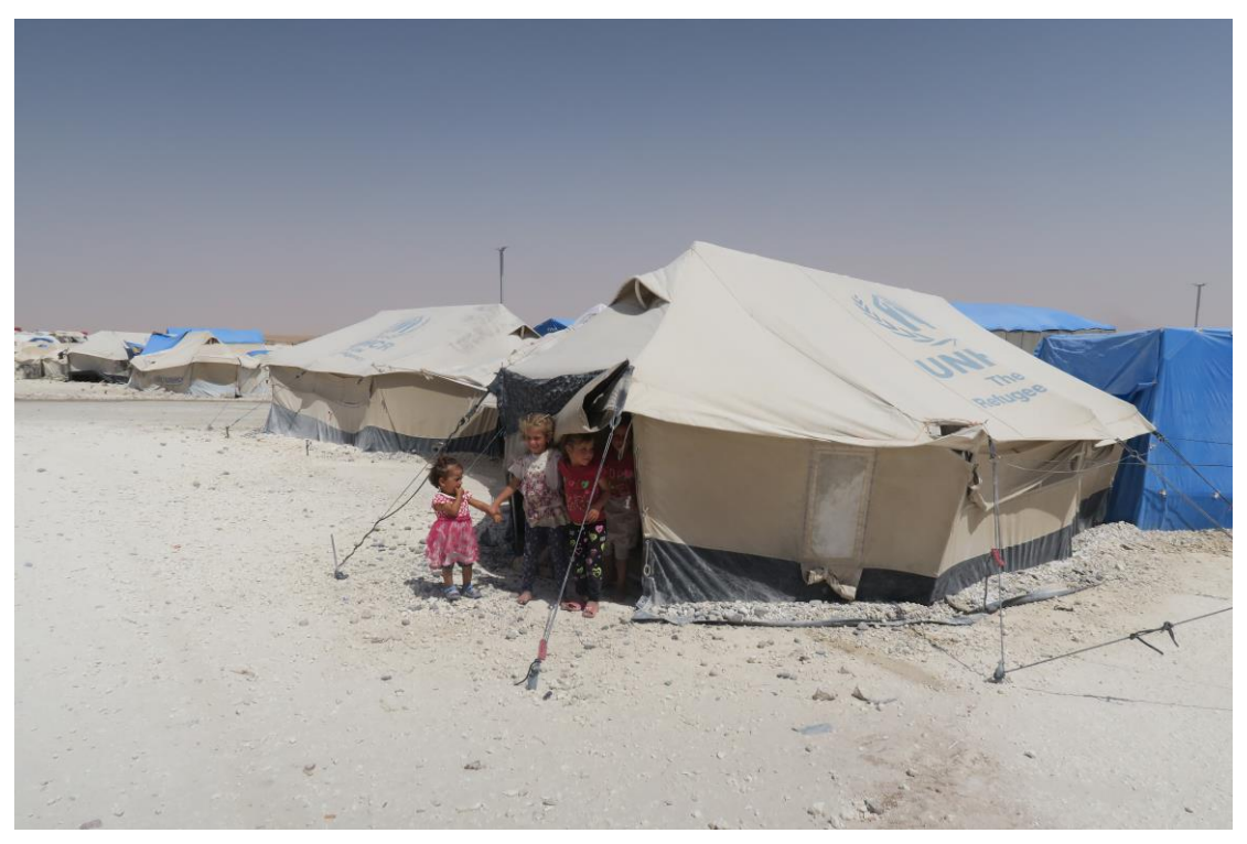
Children displaced by the battle in Ragga sheltering in IDP camp in Ain Issa, northern Syria.

Syrian government forces lost control of Raqqa City to armed opposition groups including Ahrar al Sham and Jabhat al-Nusra in early March 2013, making Raqqa the first Syrian provincial capital from which government forces were expelled entirely since the beginning of the uprising in 2011. After a brief power struggle with other armed groups, by the end of 2013 the IS had taken full control of the city, which it held until June 2017, when the ongoing military operation to recapture the city was launched by the SDF and US-led coalition forces.