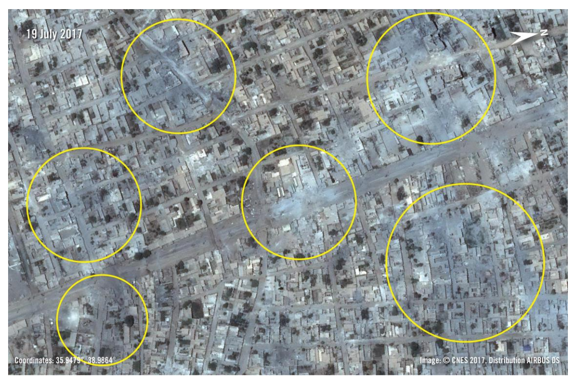
Raqqa, Ihsewa crossroad area. Imagery taken on 19 July 2017 after a series of strikes launched on 9 June. Yellow circles highlight some of the damaged areas. Coordinates: 35.9479°, 38.9864°.

It all happened in the space of a few minutes, sometime between 1 and 2pm, the shells struck one after the other. It was indescribable, it was like the end of the world – the noise, people screaming. If I live a 100 years I won't forget this carnage. Artillery shells are hitting everywhere, entire streets. It is indiscriminate shelling and kills a lot of civilians".<sup>21</sup>