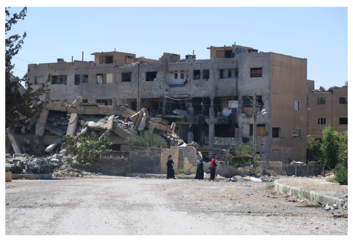
Families displaced by the conflict in Raqqa look for shelter in abandoned apartments in damaged and unsafe buildings in nearby towns previously recaptured from ISIS.

Notwithstanding these challenges, and in fact because of them, it is imperative that all the parties to the conflict take all feasible precautions to minimize harm to civilians; fully comply with the rules of international humanitarian law in the planning and execution of strikes and attacks - including by cancelling attacks that risk being indiscriminate, disproportionate or otherwise unlawful, and ending the use of explosive weapons with wide area effects in populated civilian areas, in compliance with the prohibition on indiscriminate or disproportionate attacks.