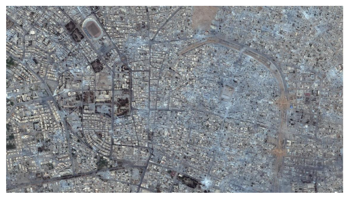
Raqqa Old City overview. Imagery taken on 19 July 2017.

IS fighters, for their part, use crude unguided projectiles, including locally manufactured mortars, and a host of improvised explosive devices (IEDs), including car bombs, all of which pose an inherent lethal danger to civilians. Moreover, the danger for civilian residents of getting caught in crossfire between the warring sides is all the more acute as IS fighters have been redoubling efforts to prevent civilians from leaving the city, using them as human shields while they launch attacks against SDF and coalition forces from amongst the