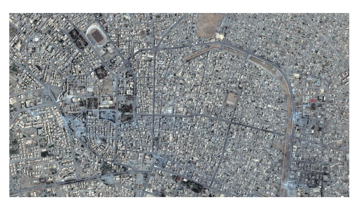
Raqqa Old City overview. Imagery taken on 2 June 2016.