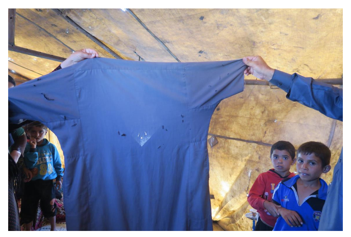
Survivors of cluster bomb attack by Syrian government forces in diplaced people's shelters south of Raqqa show Amnesty International clothes torn by cluster bomb shrapnel.

Amnesty International that the message was clear; they would be safe by the water. With the threat of imminent attacks on their towns and villages, residents fled, with many ending up in makeshift camps between the Euphrates and its subsidiary irrigation canals. However, those shelters too soon came under attack.