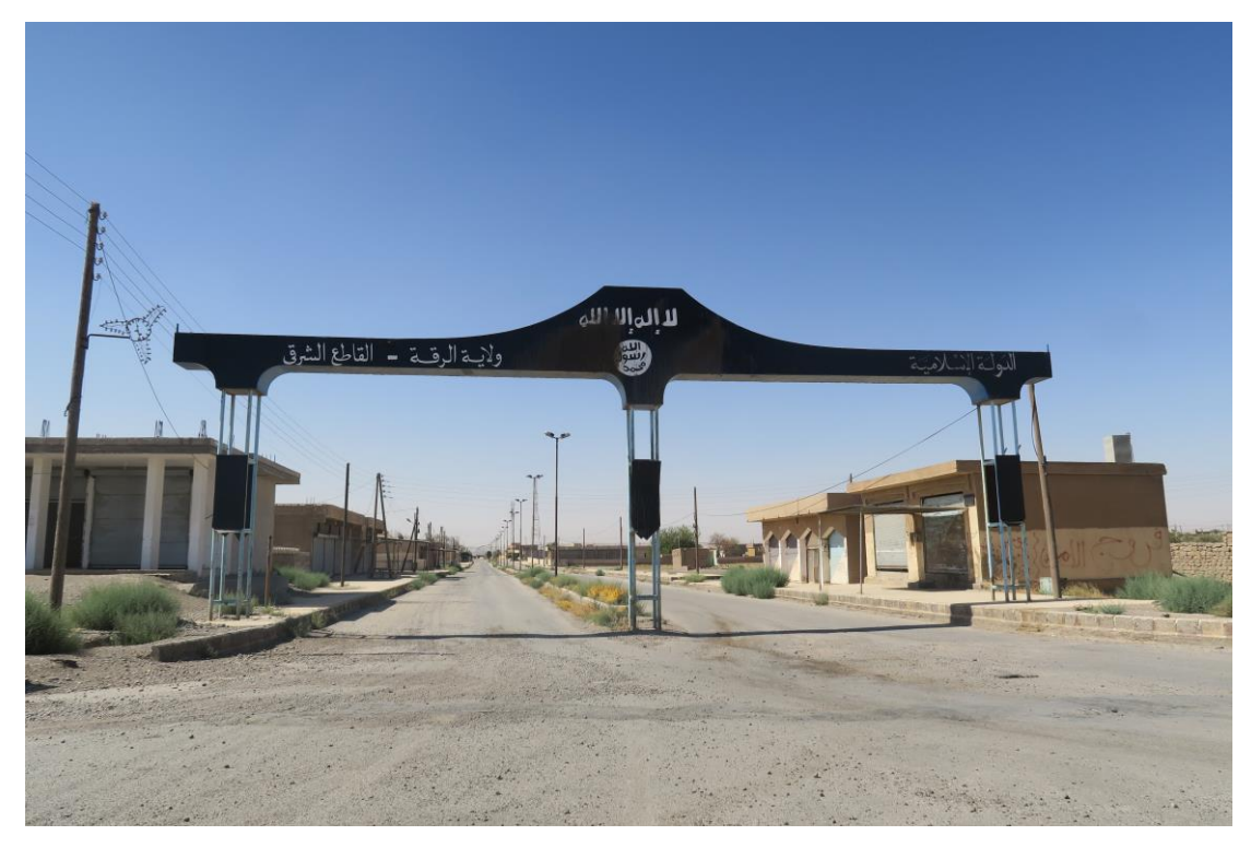
Leftover of so-called "Islamic State caliphate" east of Raqqa, now deserted.

Those who cannot afford to pay smugglers have one of two choices: either stay at home and risk being bombed or getting caught in the crossfire, or attempt to leave on their own and by so doing facing an even greater level of risk being killed by IS fighters or by the IS' mines and booby-traps.