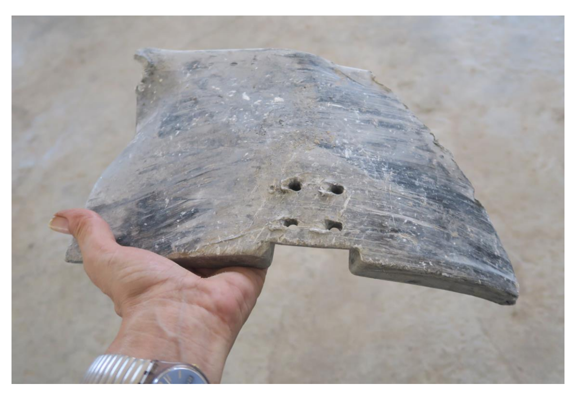
Fragment of a guidance fin from an American-designed Joint Direct Attack Munition (JDAM), which is a GPS-guided air-dropped bomb. From one of the bombs used in an air strike in Hukumya/Salhiya area northwest of Raqqa killed 14 members of a family and severely wounded two others on the evening of 11 May 2017. Eight of those killed in the attack were women and five were children. The two who were wounded were both children.

Amnesty International researchers visited the site and from the pattern of destruction there seems little doubt that the house was destroyed by air strikes. At the site, the organization's researchers recovered a fragment which weapon experts identified as a guidance fin from an American-designed Joint Direct Attack Munition (JDAM), which is a GPS-guided air-delivered bomb.<sup>29</sup> It is however not clear why the house was targeted. According to the two survivors of the strike, two children aged 14 and 15, no one was in the house other than the family members who lived there – eight women, seven children and one man. Amnesty International could not establish whether IS fighters might have been hiding in or launching attacks from the fields around the house before/at the time of the strike. However even if this was the case, it would not have constituted ground for targeting a house full of civilians.