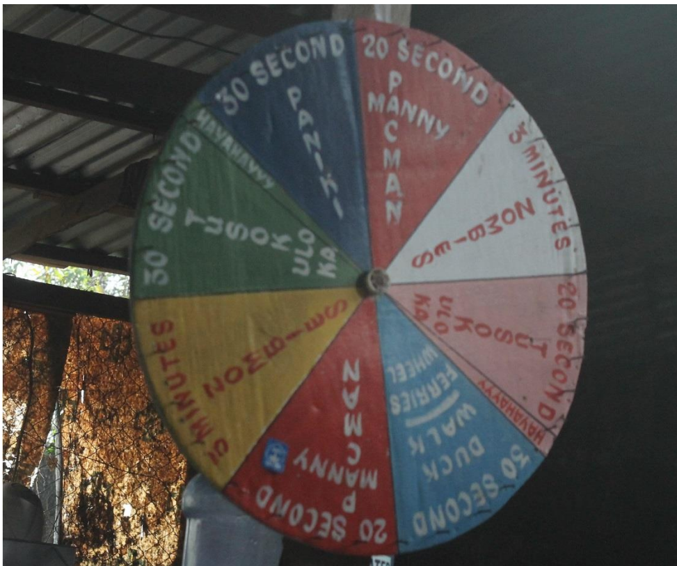
A "wheel of torture" at an undisclosed police safe house in Laguna province, south of Manila, Philippines. Early in 2014, police officers in this facility hit international headlines when they were discovered spinning this wheel as a fun way to decide what method of torture to use on detainees.