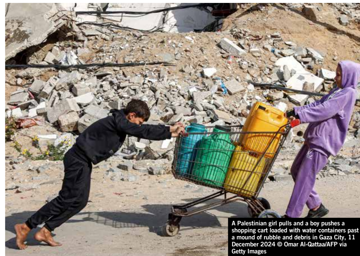
A Palestinian girl pulls and a boy pushes a shopping cart loaded with water containers past a mound of rubble and debris in Gaza City, 11 December 2024

Cover photo: Jabalía in northern Gaza on 20 January 2025, the day after a ceasefire went into effect