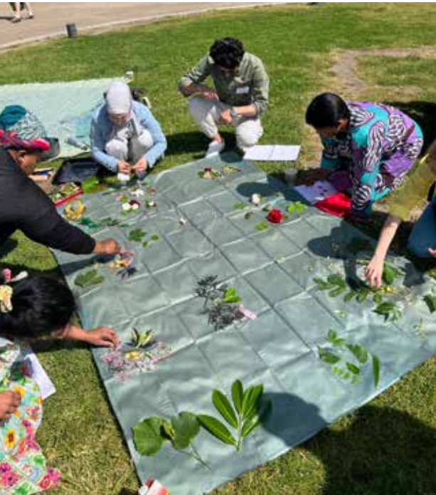
Participants from Seeking Refuge Project create a communal cyanotype mural, Refugee Week 2024 © Charlotte Vigueur

This will increase community ties and promote local refugee support.