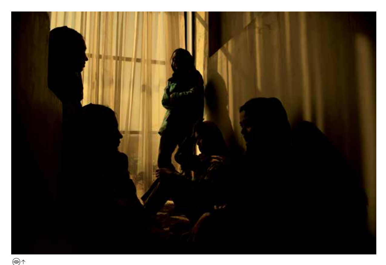
Afghan women pose for a portrait

voice against the government." This is not true. Based on interviews with 12 women who were involved in protests after the Taliban's takeover, five of whom were detained, Amnesty International has found that many women protesters in Afghanistan have been subjected to arbitrary arrest and detention, enforced disappearance and torture and other ill-treatment.