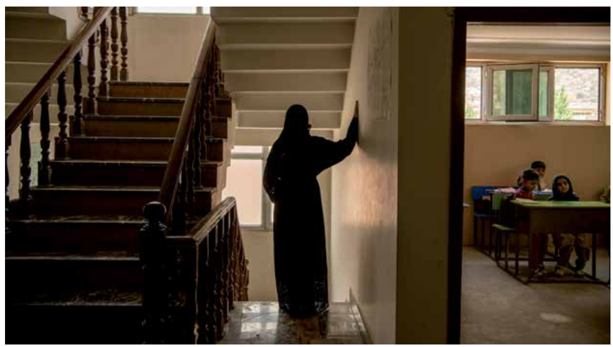
An Afghan woman poses for a portrait in her workplace.