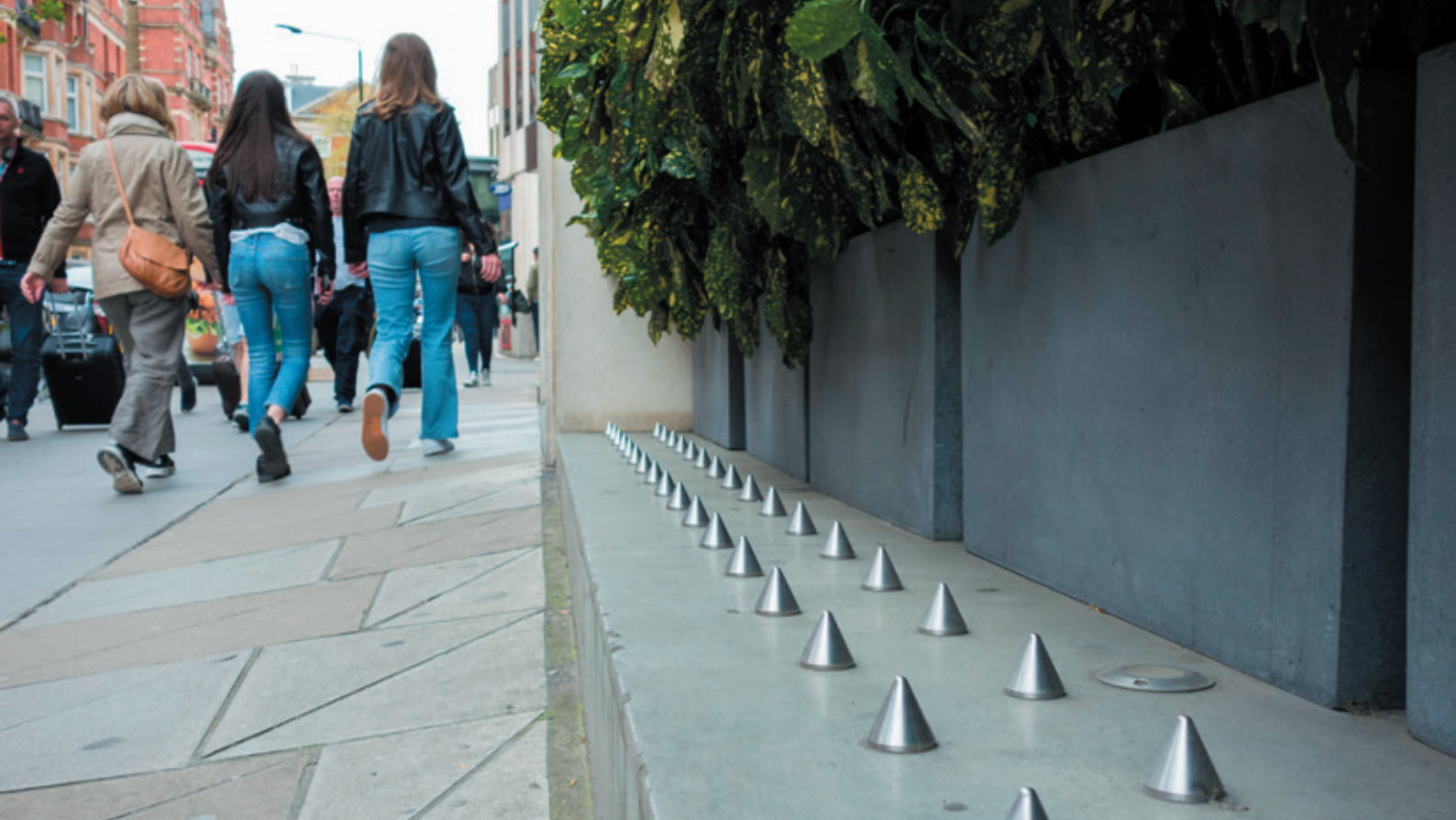
Above: Metal spikes, designed to prevent people sleeping rough, outside the Warner Music Group headquarters in Kensington, London

He said that he had been diagnosed with chronic obstructive pulmonary disease and fibromyalgia. He had a sleeping bag and a blanket: 'I don't want to sleep in a tent, my sleeping bag and blanket are enough', he said. He said he was avoiding the homeless hostel 'like the plague'. He said that he had never lived there but had heard from others who had that it was 'run down and with a lot of drug users'. 24