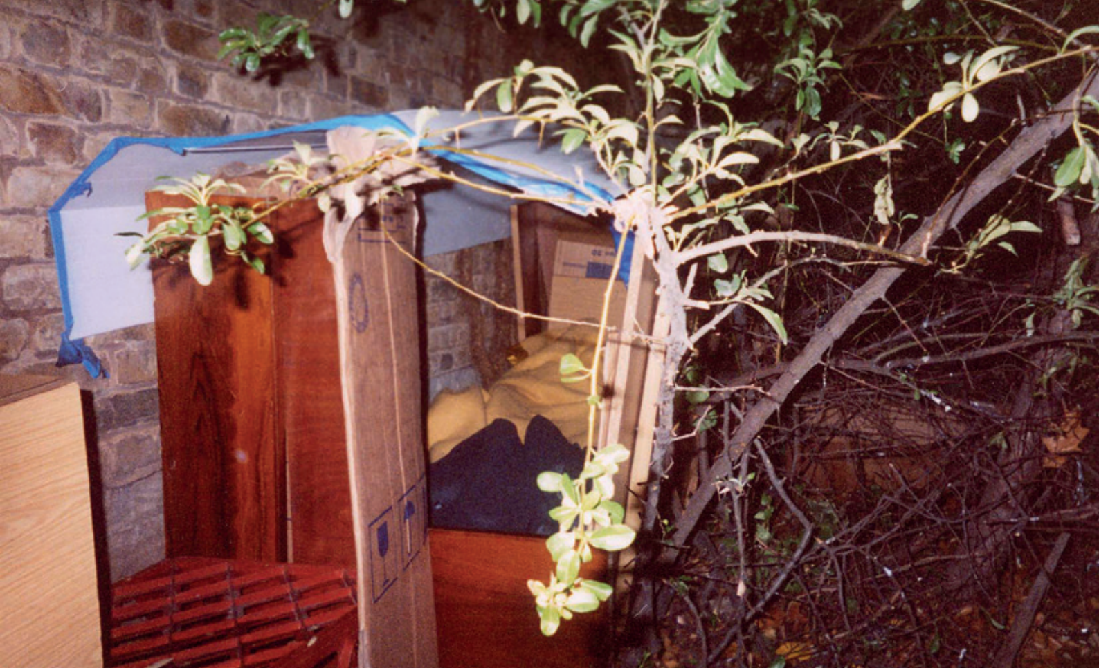
Above: Shelter constructed for sleeping rough. Photo by Ruben Torosyan from Stories from Gilded Pavements (London 2002-5) by Anthony Luvera

The changes were accompanied by the prioritisation of homelessness on the Scottish government's agenda since 2017 and its commitment to transition to an approach that over time does away with temporary accommodation and adopts 'Housing First' as the first response to people experiencing severe and multiple disadvantage. However, the removal of barriers also meant a dramatic increase in the number of people living in temporary accommodation in Scotland: 13,097 in March 2021, a 21 per cent rise from pre-Covid numbers. Although this has placed an increasing burden on local authorities, it also highlights the need for changes in law and policy to be accompanied by long-term investment in creating truly affordable housing stock to match growing need.