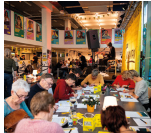
Letter writing event in Antwerp, Belgium, for Write for Rights 2022.

HAVE THE SPACE required for them to engage emotionally and develop their own attitudes.