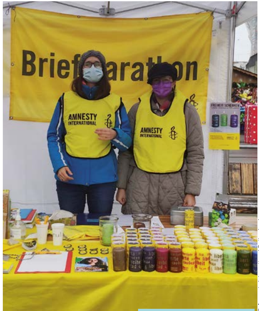
Amnesty Switzerland activists participate in Write for Rights 2021.

Human rights are not luxuries to be met only when practicalities allow.