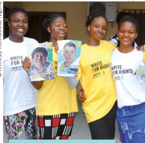
Amnesty Nigeria activists participate in Write for Rights 2021.

Read about the people we're fighting for: www.amnesty.org/writeforrights