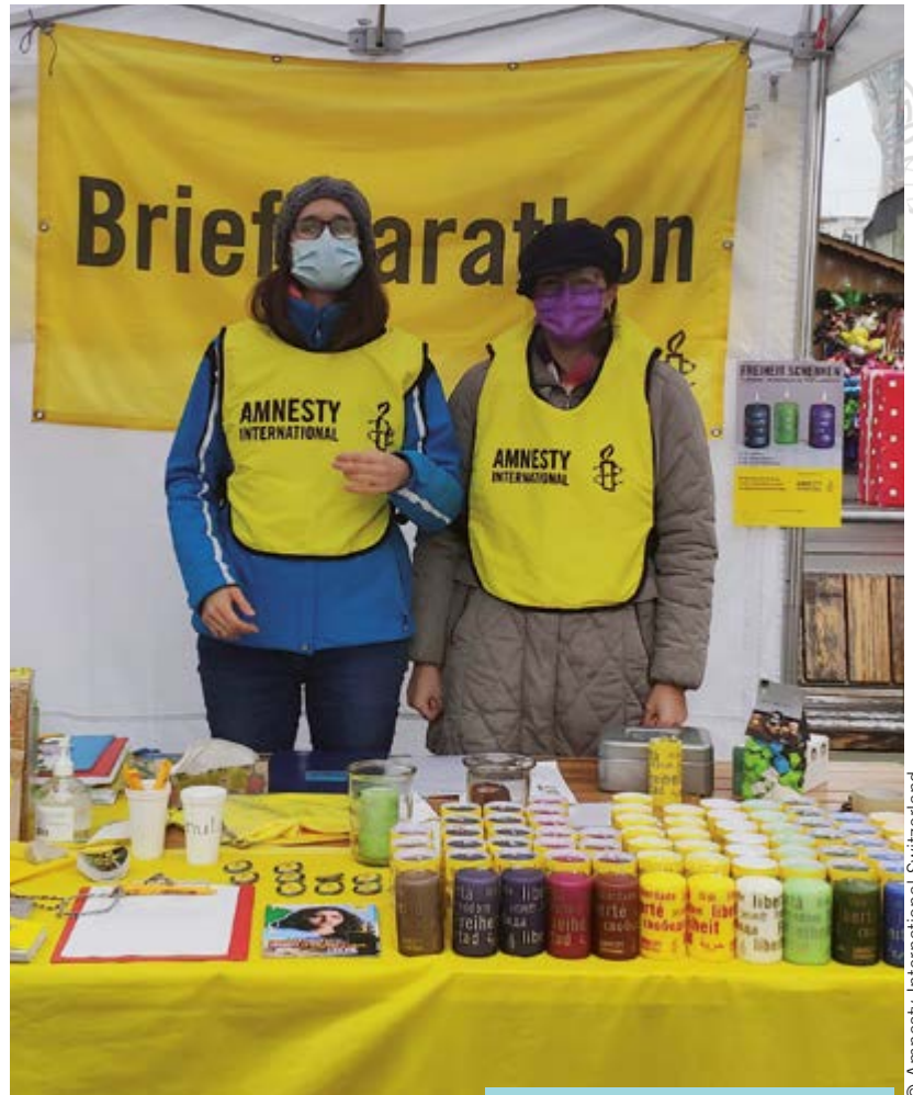
Amnesty Switzerland activists participate in Write for Rights 2021.

Human rights are not luxuries to be met only when practicalities allow.