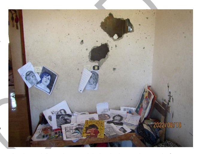
Duniana al-Amour's artwork in her bedroom, damaged after a projectile punctured holes in the wall and took her life on 5 August 2022

The weapon's accuracy, the round's penetration of a wall of the al-Amour family's house, the significant distances between the al-Amour family's house and the closest watchtowers (relative to the weapon's precision), and the fact that the Izz al-Din al-Qassam Brigades' tower was not hit or damaged even though it was much closer to the Al-Quds Brigades' tower than the Al-Amour family's house lead Amnesty International to believe that Israeli forces deliberately targeted the al-Amour family's house.