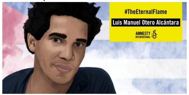
Charges Violate Freedom of Expression, Association