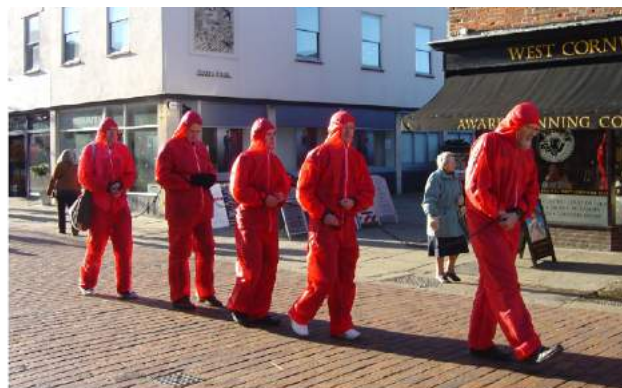
◀ Guantanamo demonstration November 2007 Chained prisoners.