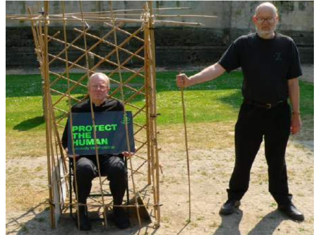
◀ Cage event, Chichester Cathedral Green, April 2011