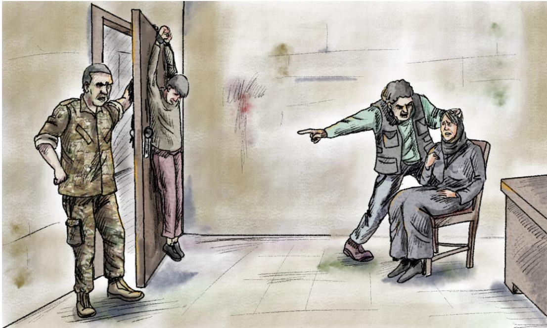
👁️ ↑ A woman Amnesty International spoke with told of how her son had been tortured in front of her during interrogation.

writing a report saying that he can't take on anymore and I'll send it. You do what you want'. ” 189 He was sent back to the Ministry of Defence, where interrogation and torture continued.