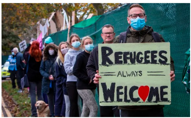
▲ Pro-migrant demonstrators outside Napier Barracks in Folkestone, Kent, gathered in a show of support to welcome migrants to the area.

https://www.theguardian.com/uk-news/2020/oct/17/refugeesupporters-clash-with-far-right-activists-in-kent-protests