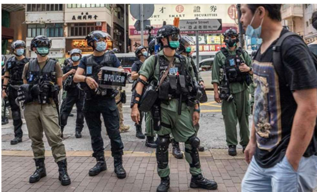
Police patrolling streets in Hong Kong

“The Hong Kong authorities must stop using national security as a pretext to excessively restrict freedom of expression and other human rights.”