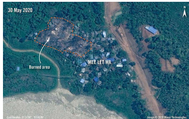
Satellite images showing the attacked areas

Through remote interviews of civilians, the analysis of fresh satellite images and verified video footage Amnesty was able to report of indiscriminate airstrikes by the hands of the Myanmar military, which have killed civilians, including children.