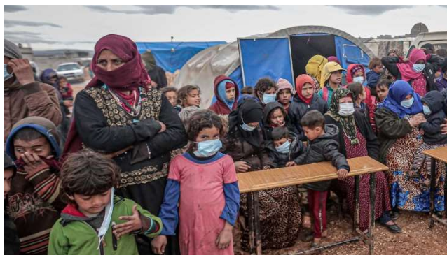
Syrian civilians in refugee camps