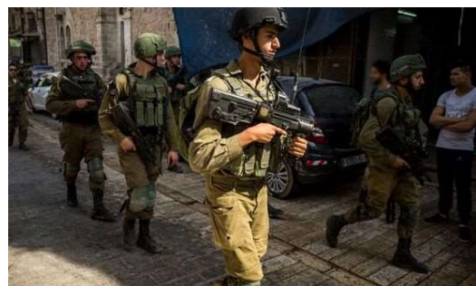
Israeli soldiers escorting an Israeli settler through the West Bank